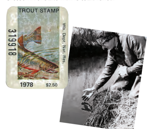
Spills Law engenders cleanup

DNR's Office of Endangered and Nongame Species is created. ** Wisconsin's Hazardous Substance Spills Law is enacted. ** Federal law bans chlorofluorocarbons (CFCs) in aerosol cans. ** First Trout Stamp is established at $2.50, with funds dedicated to supplementing trout stream habitat improvement. ## La Crosse River State Trail is established.