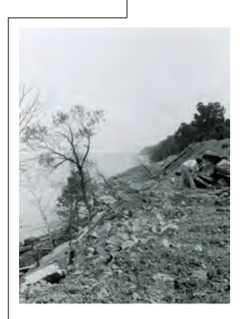
Lake Michigan shoreline erosion

DNR creates the state's first Inland Lake Renewal Project and expands Coastal Zone Management program to include the Great Lakes. ** Congress enacts Safe Drinking Water Act. ** State park campsite reservation program begins.