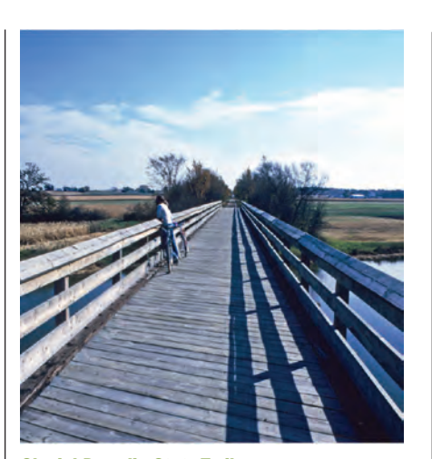
Glacial Drumlin State Trail

Ojibwe tribes exercise their right to hunt deer for the first time offreservation through negotiation with DNR. ** Glacial Drumlin State Trail is established.