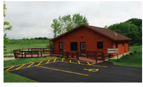
Accessible cabin at Kohler-Andrae State Park

Green Bay-Greenleaf State Trail is established. ## First accessible cabin is opened at Mirror Lake State Park. Over the next two decades, seven more cabins with amenities are opened at Buckhorn, Harrington Beach, High Cliff, Kohler-Andrae and Potawatomi state parks, Kettle Moraine State Forest-Southern Unit and Richard Bong State Recreation Area.