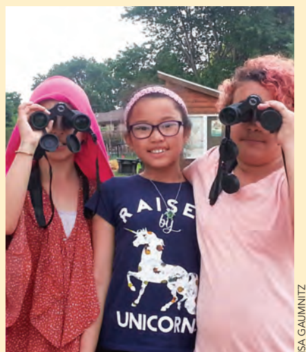
From expansive wildlife areas to urban settings, birdwatching offers a way for all ages and experience levels to connect with nature.