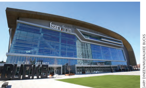
Bird City Wisconsin worked with the NBA's Milwaukee Bucks to make their new Fiserv Forum a bird-friendly building, including design efforts to help stem bird-window collisions.

That Southwest Wisconsin Grassland and Stream Conservation Area is now embedded in an even larger partnership project, the Southwest Wisconsin Grass-