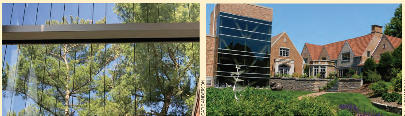
The Leigh Yawkey Woodson Art Museum in Wausau has added parachute cord to the outside of a large window to help break up the reflection and prevent collisions by birds.