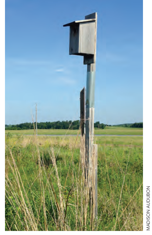
A total of 179 kestrel nest boxes are included in the Madison Audubon monitoring program this year.

Smith monitored over 70 nest boxes himself at that time, logging more than 500 miles of travel between nest boxes each summer. He worked to recruit more volunteers to help, and with