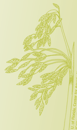
U. of Florida, Center for Aquatic Plants (Gainesville)

We gratefully acknowledge the Wisconsin Coastal Management Program , part of the Wisconsin Department of Administration , and overseen by the Wisconsin Coastal Management Council , for funding the 2010 reprinting of this second edition of this handbook.