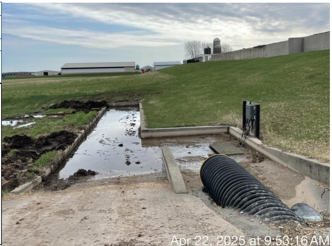
Photo Description: Standing on the West side of the Leachate pit pump looking East. View of concrete spreader bar,