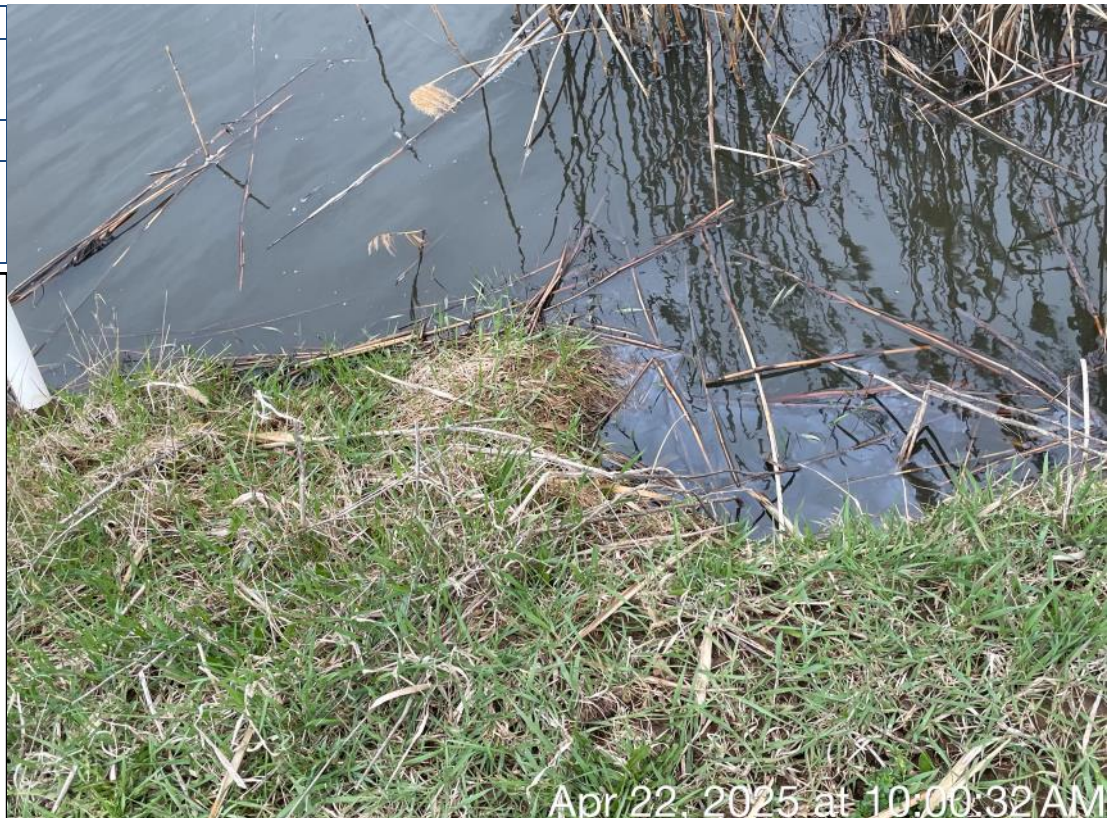
Photo Description: Standing on the East side of the leachate pit. View of possible sloughing.