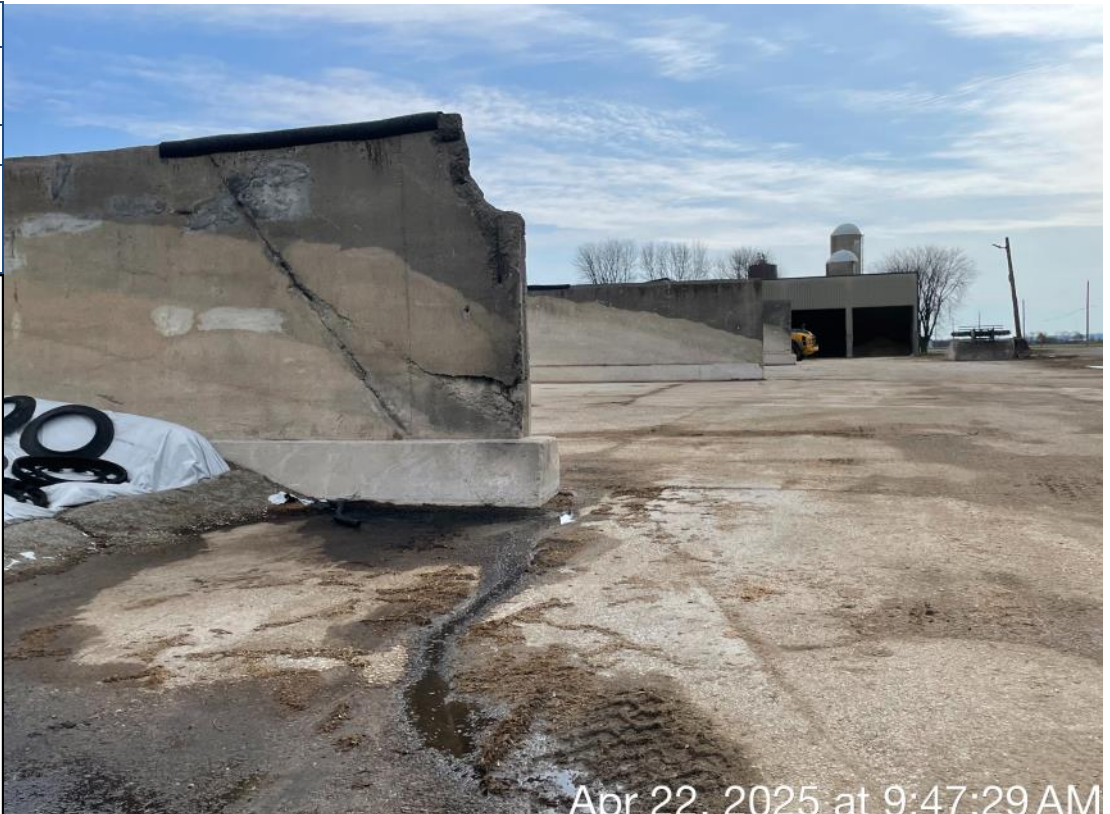
Photo Description: Standing on the Southwest side of the FSA looking East. View of FSA.