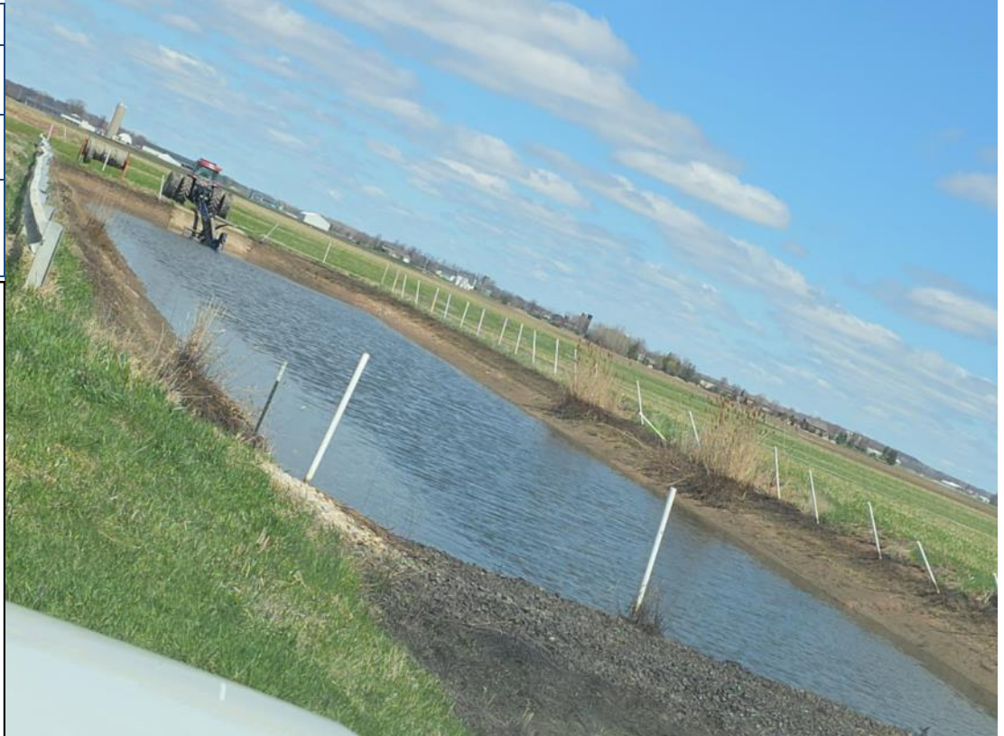
Photo Description: Jeremy Van Asten, sent Jacobs a photo on April 25th at 12:09 pm of their leachate pit pumped down.