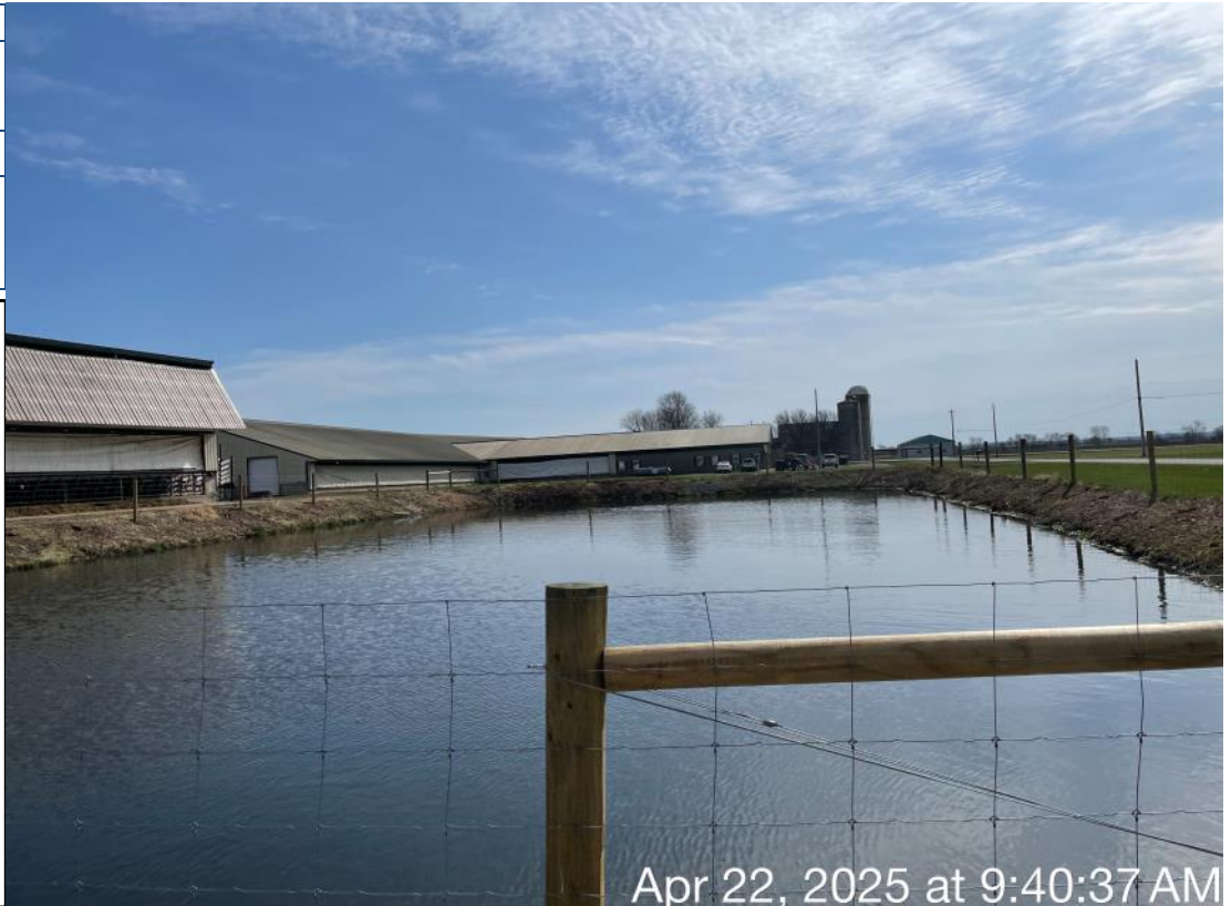
Photo Description: Standing on the West side of WSF 1 looking East. View of WSF 1.