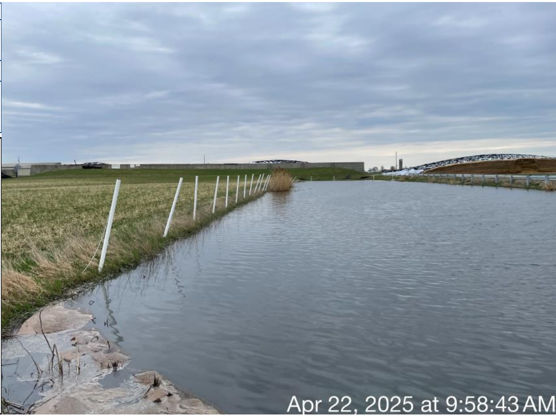
Photo Description: Standing on the North side of the leachate pit looking South. View of leachate pit.