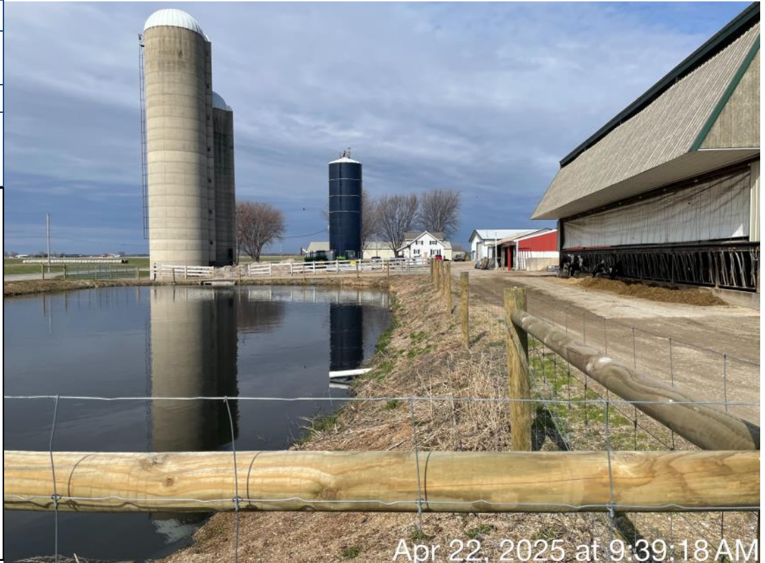
Photo Description: Standing on the North East side of WSF 1 looking West. View of WSF 1.