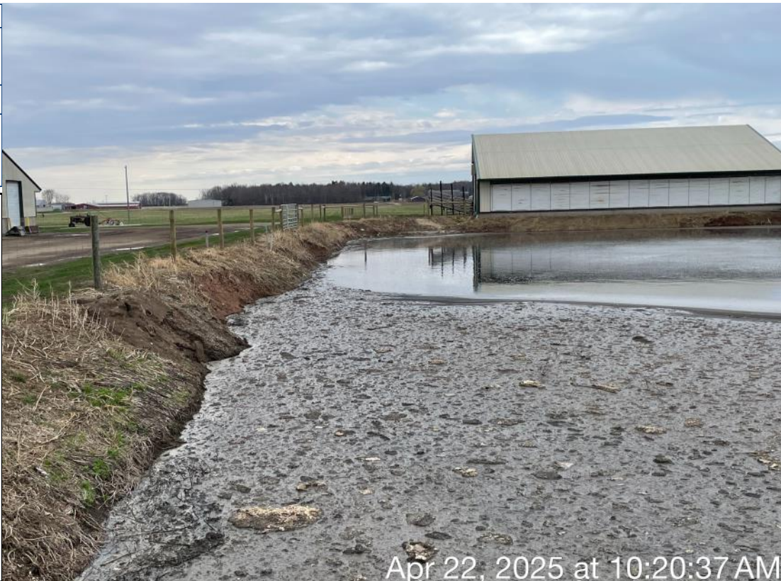
Photo Description: Standing on the North side of WSF 2 looking South. View of WSF 2.