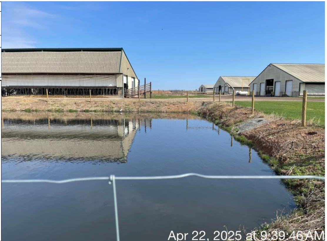
Photo Description: Standing on the Southeast side of WSF 1 looking North. View of WSF 1.