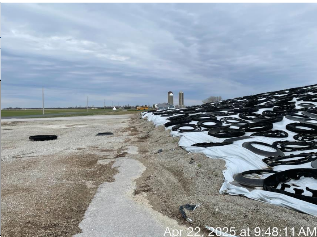
Photo Description: Standing on the West side of the FSA looking East. View of FSA.