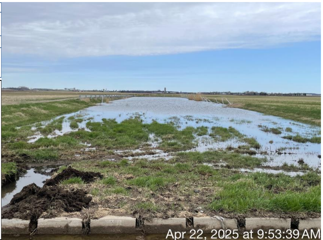
Photo Description: Standing on the South side of the Leachate pit looking North. View of Leachate pit.