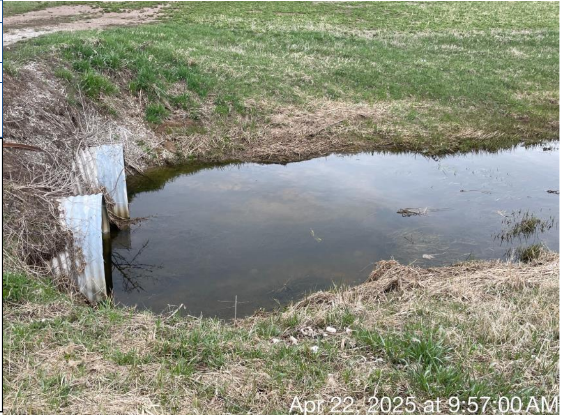
Photo Description: Standing on the North side of the Leachate pit looking North. View of creek. Water was clear with no observations of waste feed or other materials.