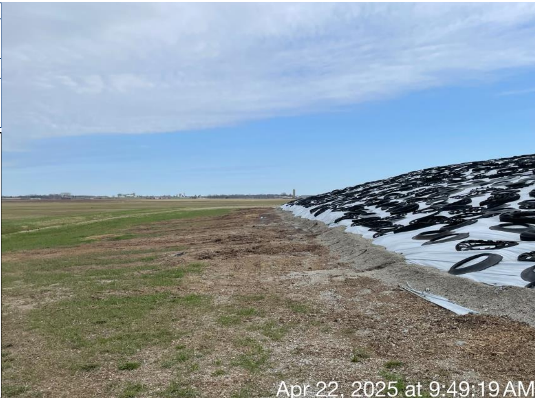
Photo Description: Standing on the Southwest side of the FSA looking North. View of FSA.