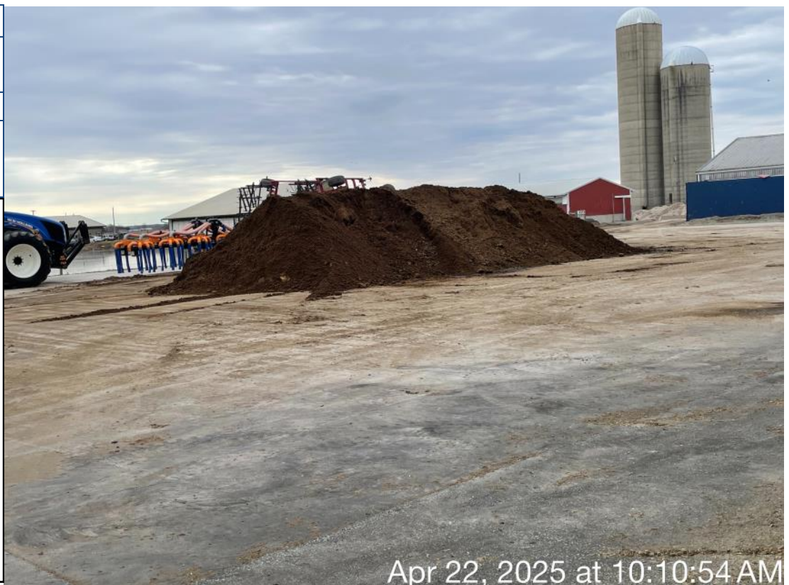
Photo Description: Stacked solid manure on concrete, runoff flows to a designated concrete channel to WSF 1.