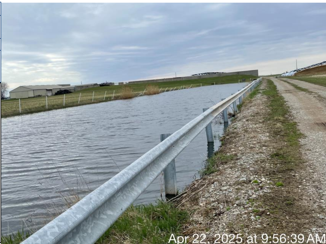
Photo Description: Standing on the West side of the Leachate pit looking South. View of Leachate pit.