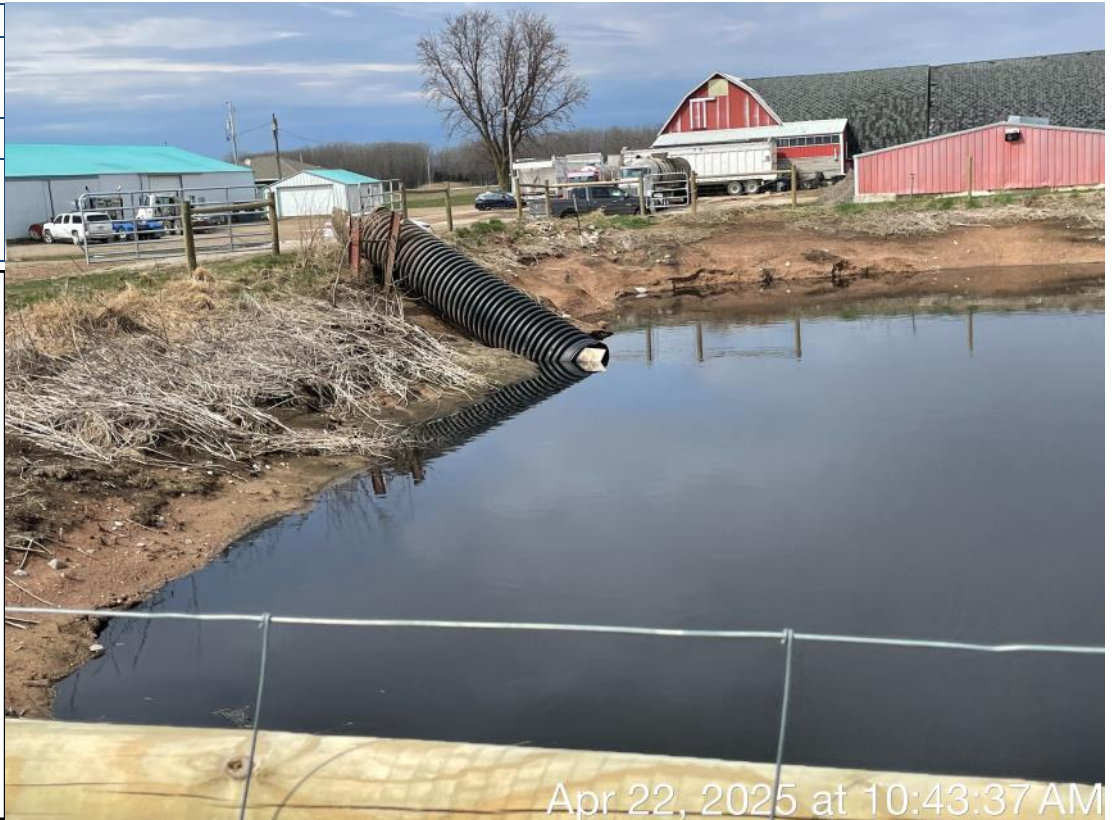
Photo Description: Standing on the East side of WSF 4 looking West. View of WSF 4.