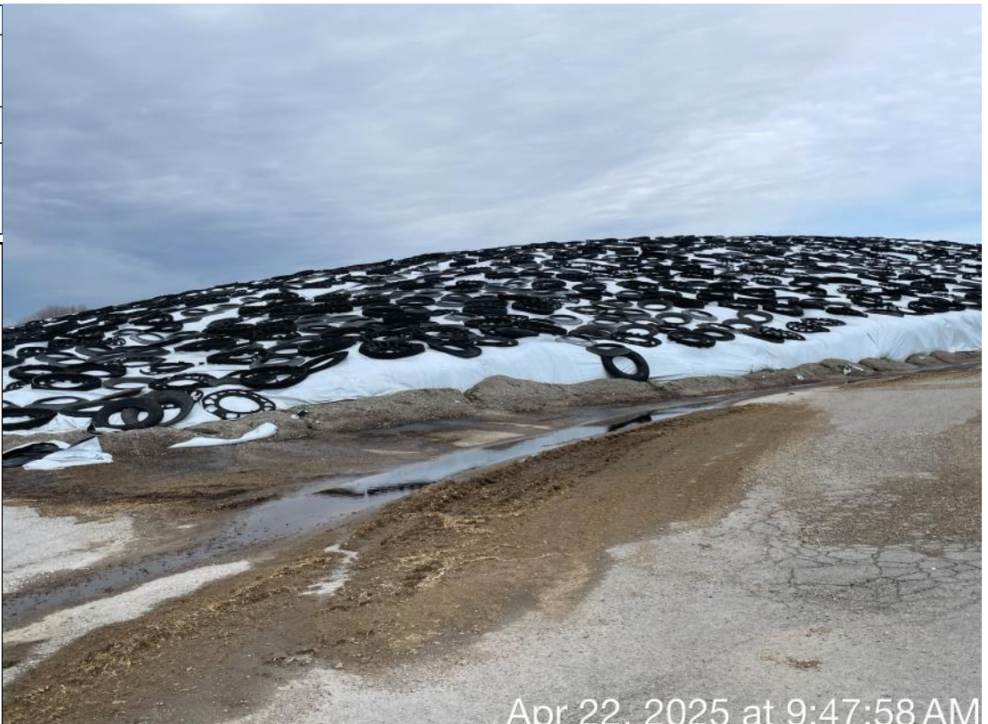
Photo Description: Standing on the South side of the FSA looking Northwest. View of FSA.