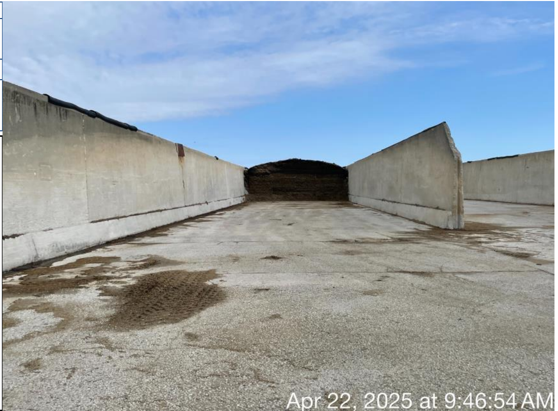
Photo Description: Standing on the South side of the FSA looking North. View of FSA.