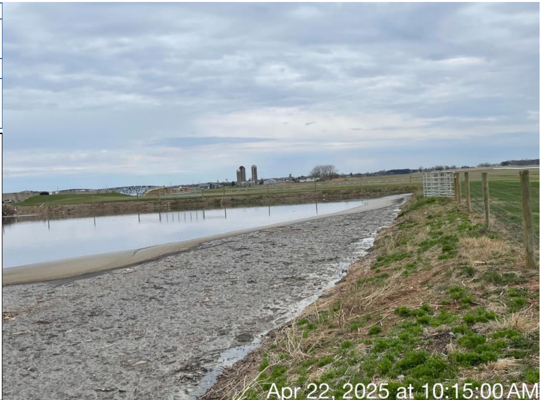
Photo Description: Standing on the North east side of WSF 3 looking West. View of WSF 3.