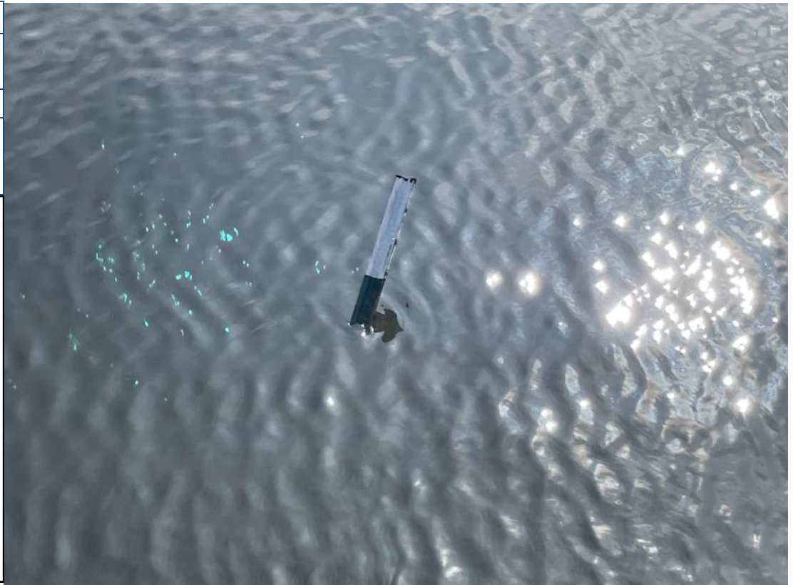
Photo Description: Standing on the West side of WSF 1. View of marker.