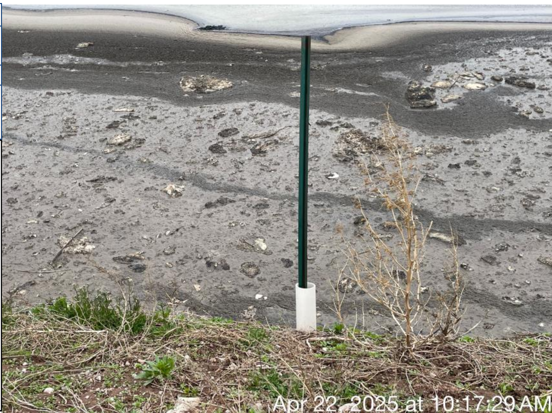
Photo Description: Standing on the North side of WSF 2. View of marker.