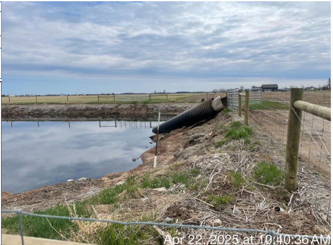
Photo Description: Standing on the West side of the XX pit. View of WSF 4.