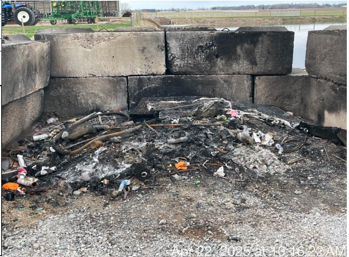
Photo Description: Standing on the North side of WSF 2 looking West. View of burn pit.