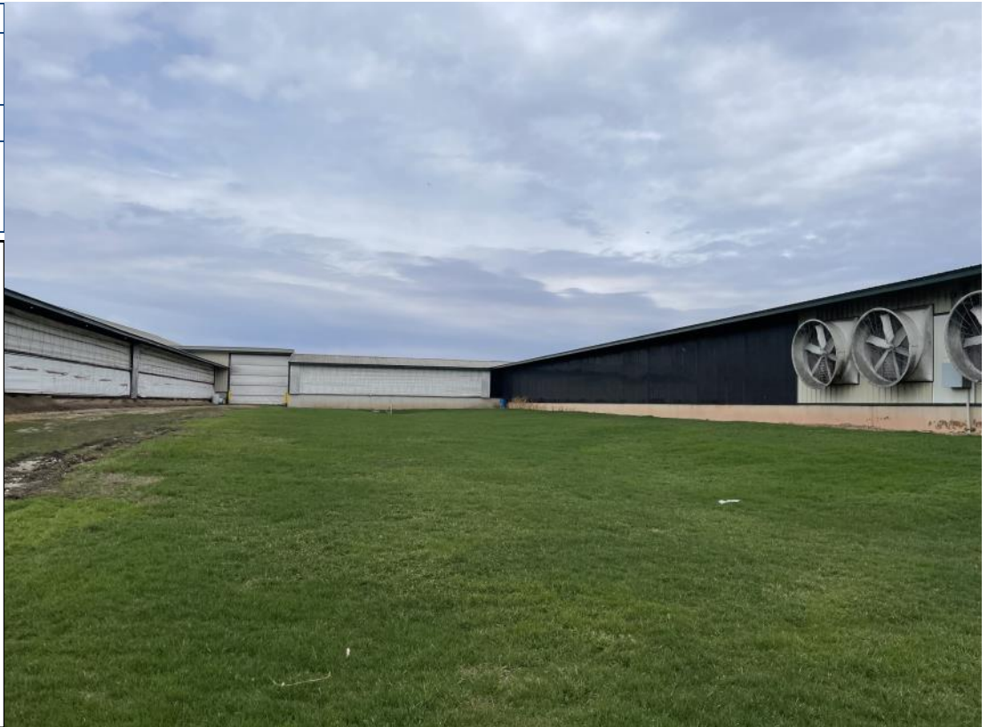
Photo Description: Standing on the East side of the Free stall barns looking West.