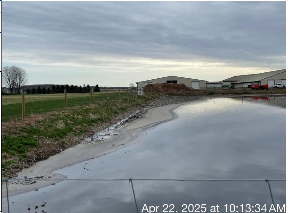
Photo Description: Standing on the West side of WSF 3 looking East. View of WSF 3.