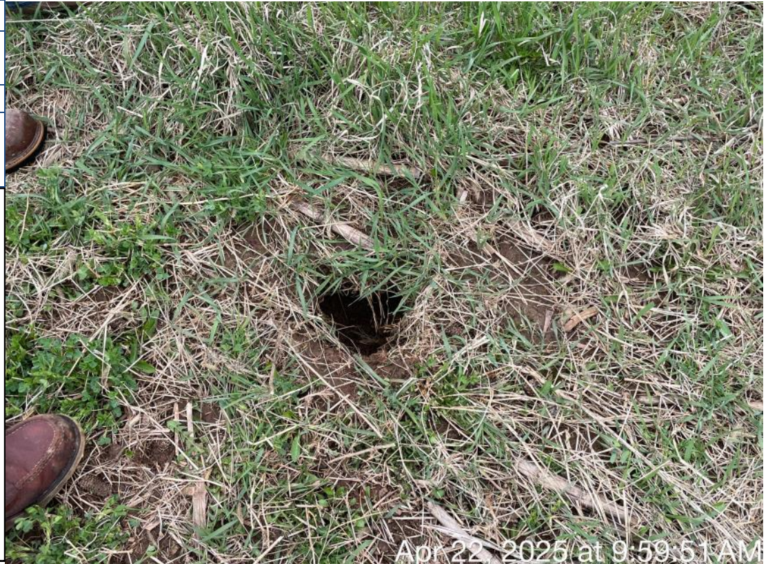
Photo Description: Standing on the East side of the leachate pit. View of burrow hole.