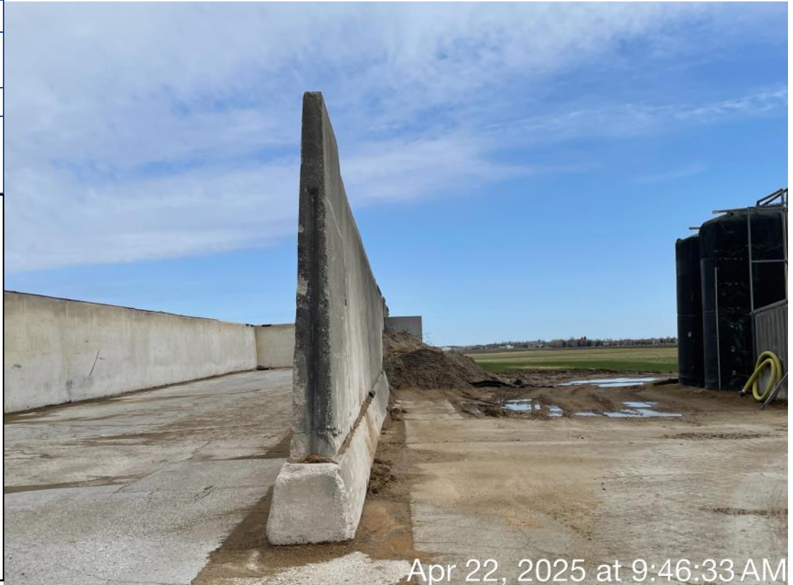
Photo Description: Standing on the South side of the FSA looking North. View of FSA.