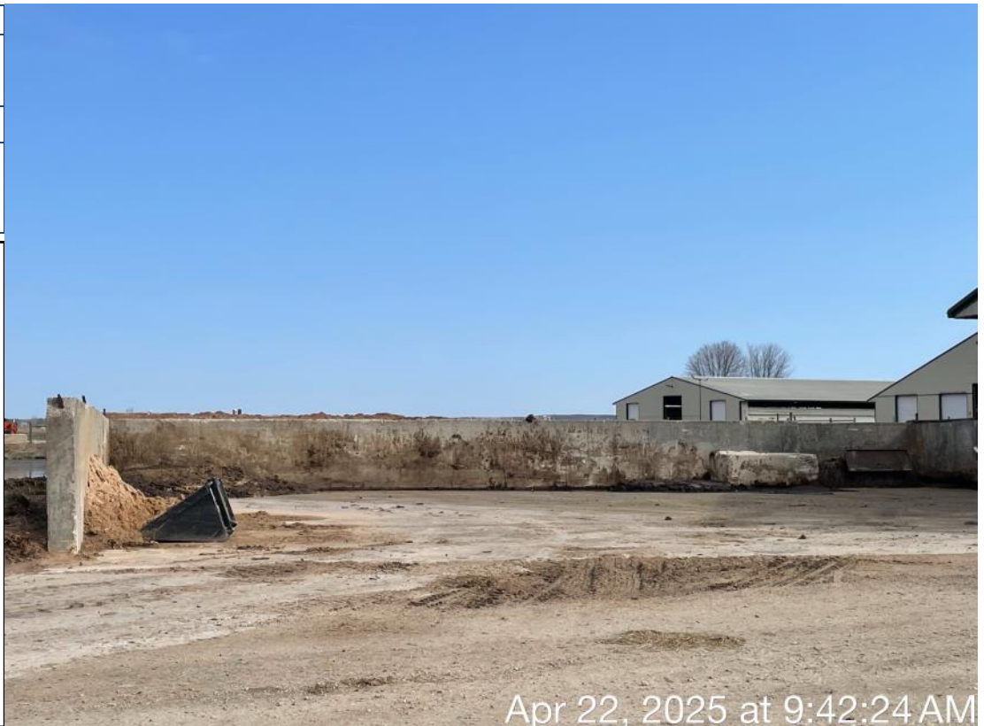
Photo Description: Concrete Storage 2. Solid manure is stored on a concrete pad between WSF 1 and WSF 2. This pad directly drains into WSF 2.