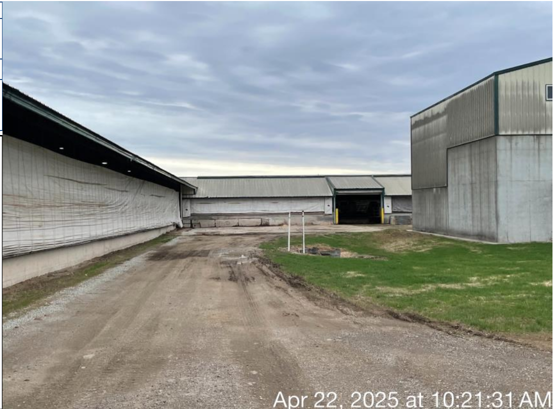
Photo Description: Standing on the East side of WSF 2 looking East.