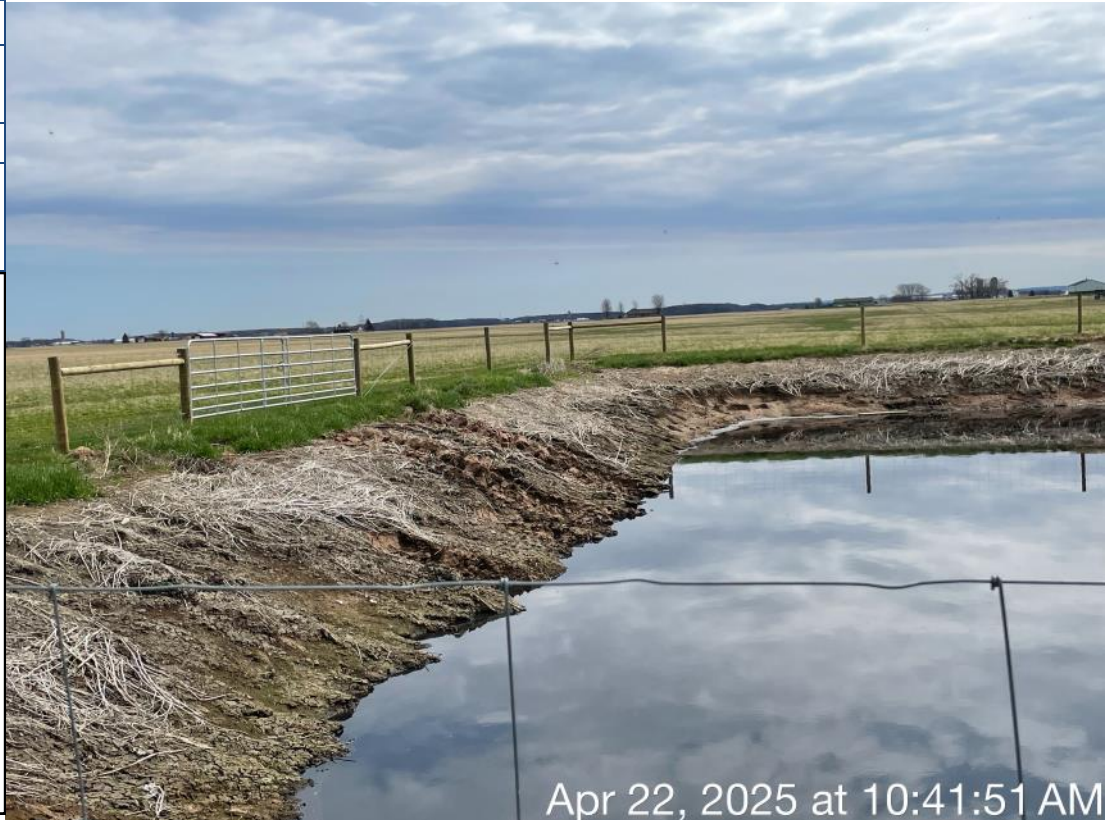
Photo Description: Standing on the West side of WSF 4 looking East. View of WSF 4.