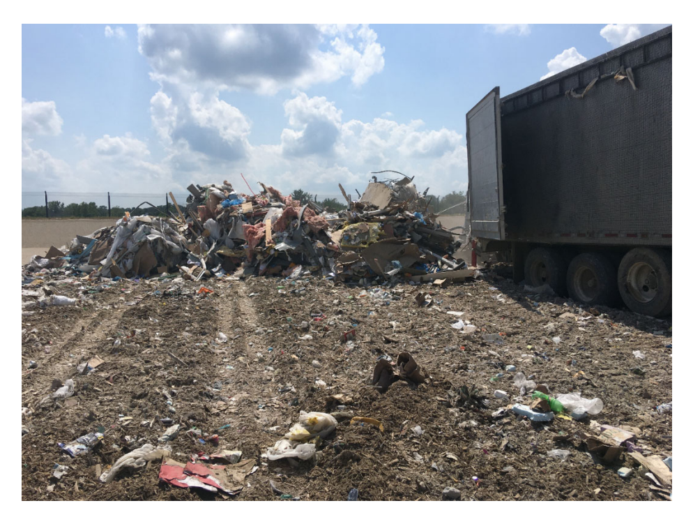
Figure 2. Fully unloaded C&D MRF residual trailer