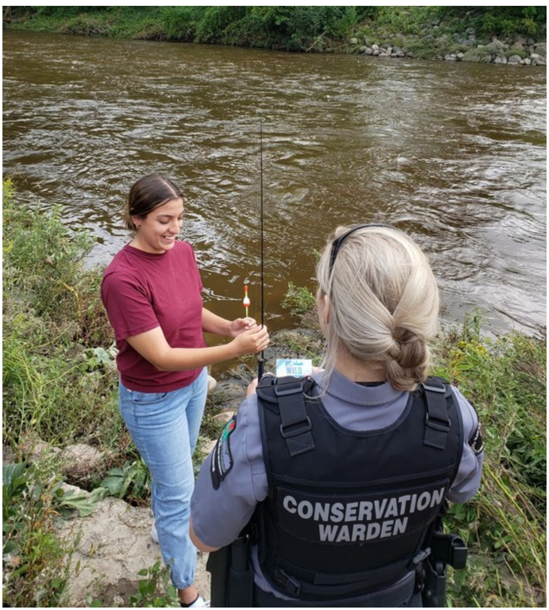
DNR Conservation Warden speaks with an angler in Milwaukee County.