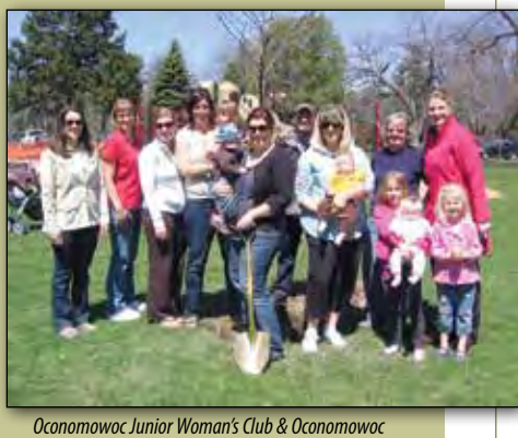
Parks & Forestry—Project Partnership