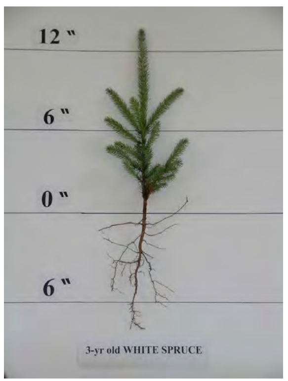
White spruce seedling for distribution