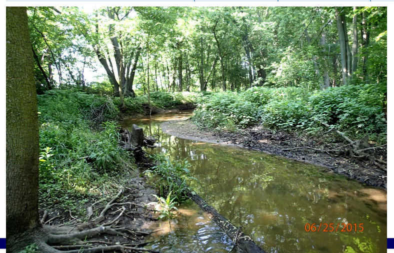
08/20/2015 Channelized Dutchman Creek downstream Oneida Street.