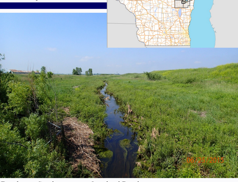
Dutchman Creek upstream Overland Road.