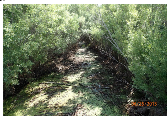
Debris on Dutchman Creek downstream Overland Road.