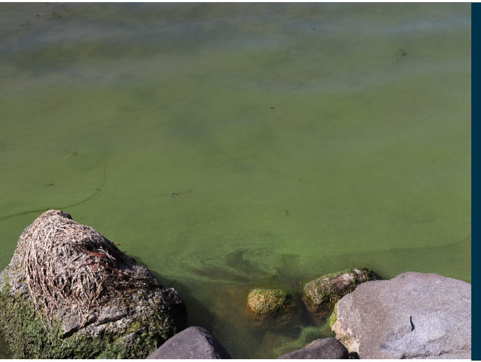
Green algae indicative of nutrient loading in surface waters.

This short survey should only take under a minute to fill out: MS4 Newsletter Survey