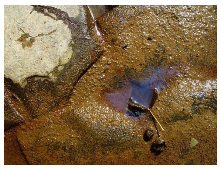
Bio sheen forming due to decomposition of organic matter.

Linda Grashoff's website: "Leptothrix discophora is a bacterium that uses iron the way we use oxygen. Some people describe this process as "breathing iron." L. discophora embeds itself in an iridescent film of its own making. The film is visible to the naked eye and often looks like an oil slick. The bacterium itself is too small to be seen except under a microscope. Other species of iron bacteria, also too small to be seen by the naked eye, can be detected by their products, called "flocculates," or "flocs" for short. Flocs have a variety of textures, depending on the bacteria producing them, but most have the color of rusted iron and are, in fact, iron oxide."