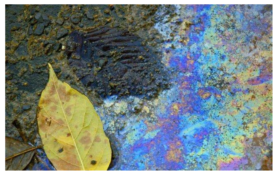
Rainbow, or metallic, bio sheen

Dr. Ghiorse: "The best field signs for Leptothrix are the color and mechanical properties of the metallic film. A Leptothrix film will be a silvery or golden in color when you look at it in reflected light and yellowish brown to dark brown or dull rust colored and granular when you blot it on white paper."