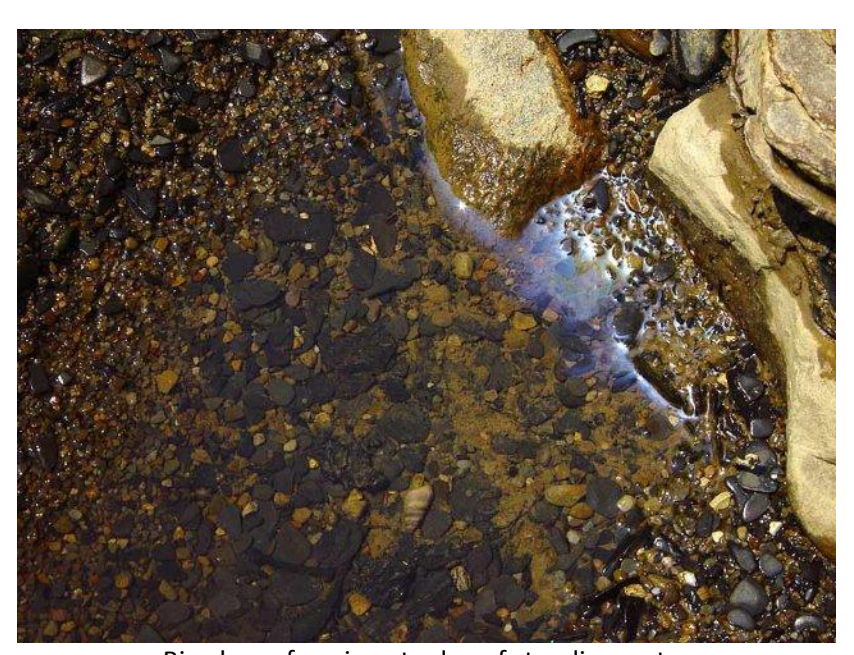
Bio sheen forming at edge of standing water

Dr. Robbins: "The film former, L. discophora , lives at a particular redox boundary--the one with the highest oxygen in contact with low oxygen. That is typically in shallow water. So, it doesn't sound like L. discophora is forming a film at depth, particularly in an environment where petroleum is sucking oxygen out of the water.