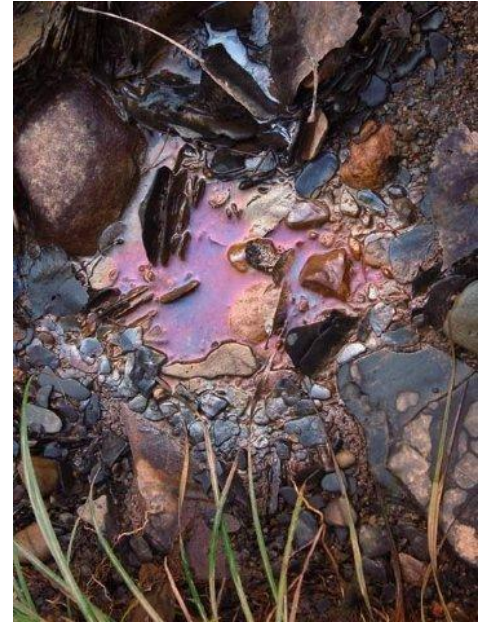
Bio sheen forming on pool of standing water