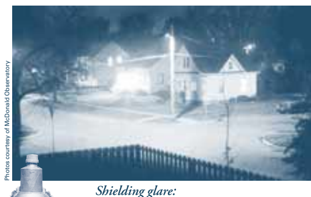
A comparison of the same street corner

The most common shoreland lights are attached to homes, garages, piers and other structures on waterfront residential property. While we may notice the glare from an unshielded