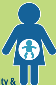
infertility & low birth weight