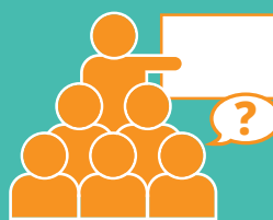
listening & feedback sessions