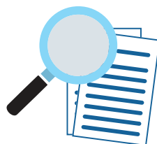
Learn More About PFAS Health Risks dnr.wi.gov/u/?q=175