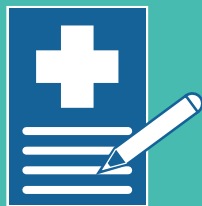
establishing PFAS health standards for drinking water, groundwater and surface water