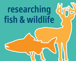
researching fish & wildlife