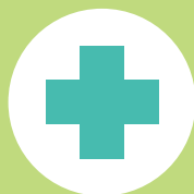
certain types of cancers

PFAS persist in the environment and the human body for long periods of time. Recent findings indicate that exposure to certain PFAS may have harmful health effects in people.