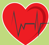
thyroid & heart issues