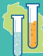
soil & water testing