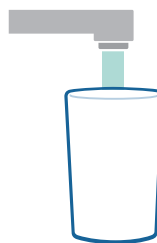
Test Your Well Water dnr.wi.gov/u/?q=177