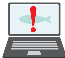
Check State Fish Advisories dnr.wi.gov/u/?q=176