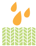
stain-resistant carpet & fabric

PFAS are a group of human-made chemicals used for decades in numerous products.