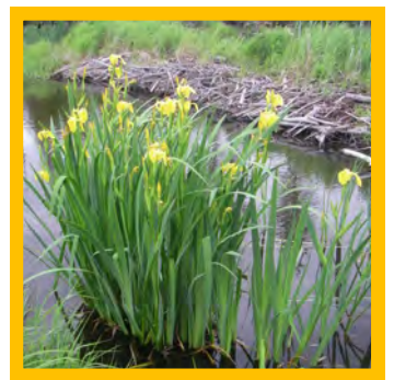
Yellow Iris ( Iris pseudacorus )