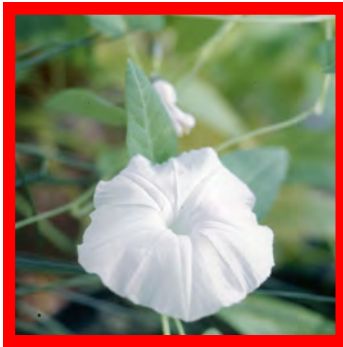
Water spinach ( Ipomoea aquatica )