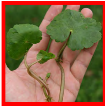
Floating marsh pennywort ( Hydrocotyle ranunculoides )