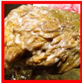
Didymo ( Didymosphenia geminata )