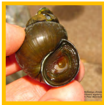
Chinese mystery snail ( Cipangopaludina chinensis )