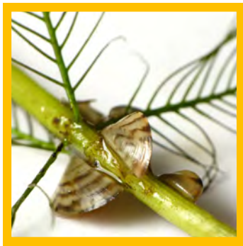
Zebra mussel ( Dreissena polymorpha )