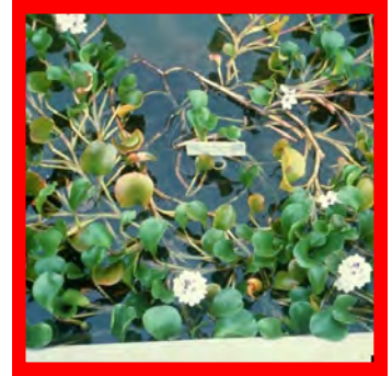
Anchored water hyacinth ( Eichhornia azurea )