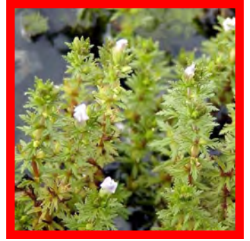
Asian marshweed ( Limnophila sessiliflora )