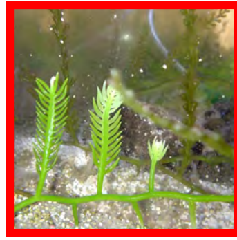
Killer algae ( Caulerpa taxifolia )