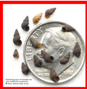
New Zealand mud snail ( Potamopyrgus antipodarum )