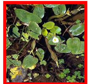
Duck lettuce ( Ottelia alismoides )