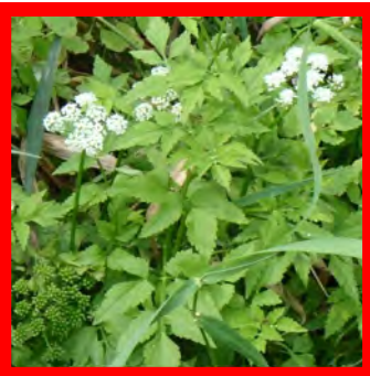
Java waterdropwort ( Oenanthe javanica )