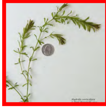
Hydrilla ( Hydrilla verticillata )