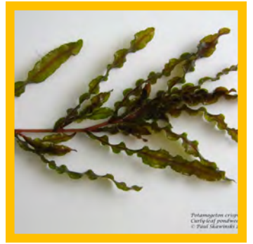
Curly-leaf pondweed ( Potamogeton crispus )