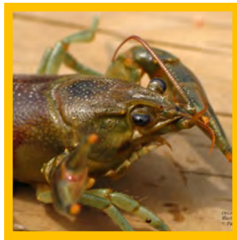
Rusty crayfish ( Orconectes rusticus )