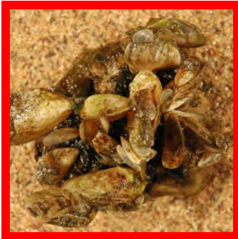
Quagga mussel ( Dreissena rostriformis )