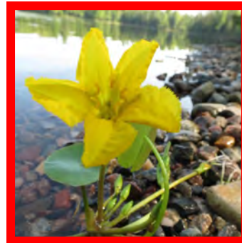
Yellow floating heart ( Nymphoides peltata )