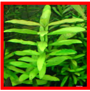
Indian swampweed ( Hygrophila polysperma )