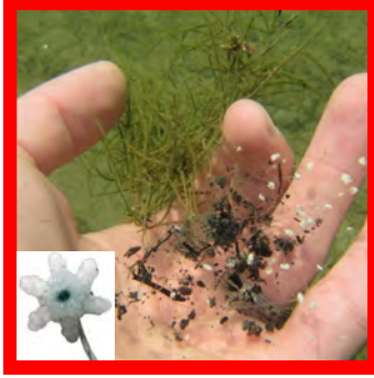
Starry stonewort ( Nitellopsis obtusa )