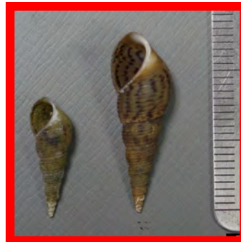
Malaysian trumpet snail ( Melanoides tuberculata )