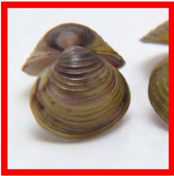
Asian clam ( Corbicula fluminea )