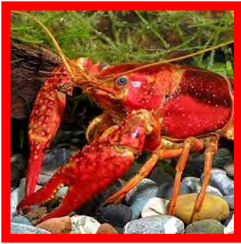
Red swamp crayfish ( Procambarus clarkii )