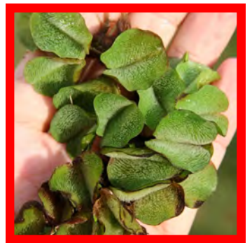
Giant salvinia ( Salvinia molesta )