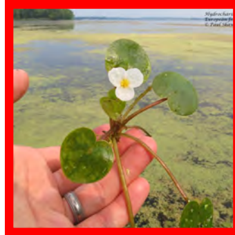
European frog-bit ( Hydrocharis morsus-ranae )