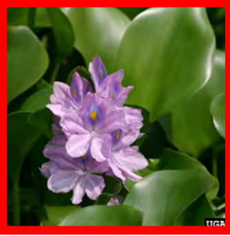
Floating water hyacinth ( Eichhornia crassipes )