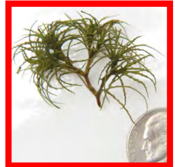
Brittle naiad ( Najas minor )