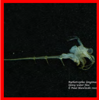
Spiny water flea ( Bythotrephes cederstroemi )