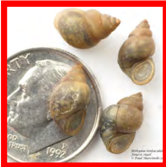
Faucet snail ( Bithynia tentaculata )