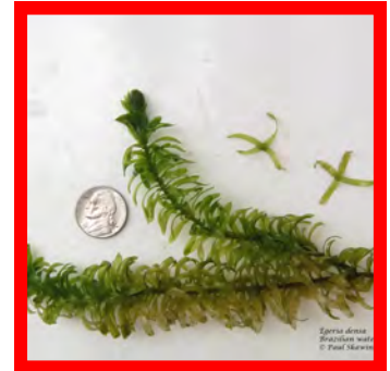
Brazilian waterweed ( Egeria densa )

Report any prohibited species as soon as possible by emailing: Invasive.Species@wi.gov .