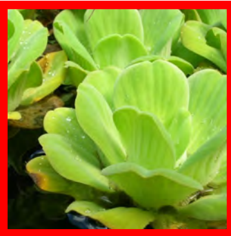
Water lettuce ( Pistia stratiotes )