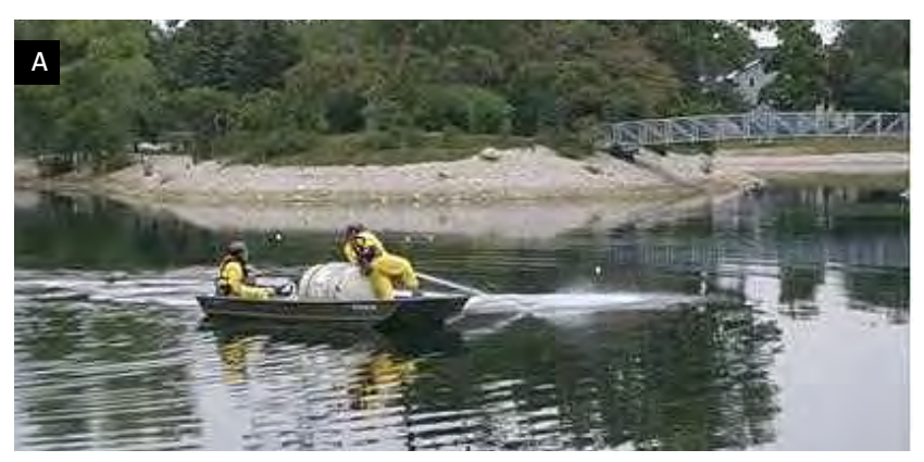
Photo: (A) Applying pesticide to control red swamp crayfish (DNR files). (B) A mostly eradicated stand of giant hogweed (Kelly Kearns, DNR).

The department successfully eradicated red swamp crayfish that were found in three ponds in southeast Wisconsin: two in Germantown, and one in Kenosha. Red swamp crayfish is a prohibited species with the potential to be highly detrimental to the state's aquatic resources. Due to its ability to travel over land to new waters, aggressive control strategies were used to prevent the crayfish from colonizing other waterbodies. Following initial detection in 2009, control efforts persisted for several years, and the department has continued to regularly survey the ponds. No red swamp crayfish were detected in the ponds during this reporting period.