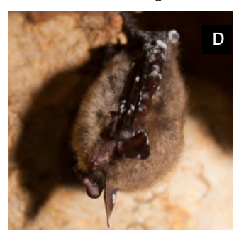
Photos: (A) Aerial gypsy moth treatment (UW-Extension). (B) Adult Jumping Worm (DNR files). (C) Adult emerald ash borer in Wisconsin (DNR files). (D) Bat infected with White-nose syndrome (Heather Kaarakka, DNR).

White-nose syndrome (WNS) is a deadly disease that develops in bats infected with the fungus Pseudogymnoascus destructans (Pd). Bats play an important role in Wisconsin's ecosystems and economy: they feed voraciously on insects which saves our agriculture industry $658 mil. to $1.5 bil. annually in pesticide costs. The 2017 winter bat survey indicated that WNS has spread to nearly all the known bat hibernating sites in Wisconsin. Department surveyors found only 16 bats compared to a previous population of 1,200 at a Grant County site where the fungus was first detected.