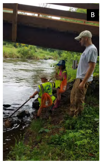
Photos: (A) Ice pack with AIS prevention message for anglers. (B) AIS monitoring at a 2018 outreach event, AIS Snapshot Day.

The department has begun efforts to prevent AIS introductions resulting from pet release and aquarium dumping. The Habitattitude campaign provides advice on responsible pet ownership and provides pet release alternatives to owners. This national program, developed through partnerships with industry, government, and academia, has been found effective in raising awareness of invasive species issues to pet owners.