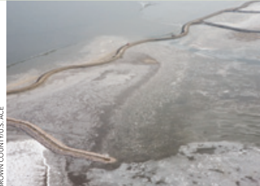
BROWN COUNTY/US. ACE

The Lower Fox River Contaminated Sediment Cleanup project is now in its fifth year of active remediation. This proj-