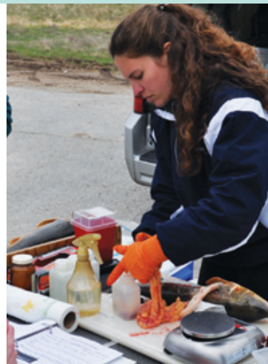
Researchers sample white suckers from the Sheboygan River for tumors and other abnormalities.

The initial focus of the 1972 Clean Water Act and the Great Lakes Water Quality Agreement was to establish better wastewater treatment infrastructure. As time went on, their focuses expanded to toxic pollutants that had been released into the rivers and harbors as the result