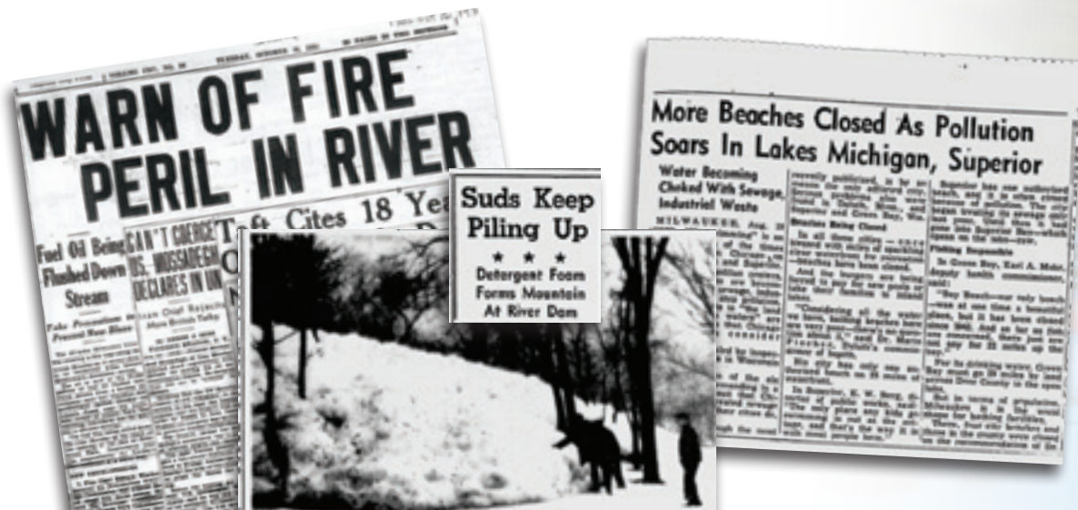
Historical headlines warn of pollution hazards on Wisconsin rivers.