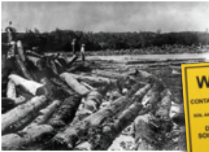
Historical logging practices damaged the St. Louis River.