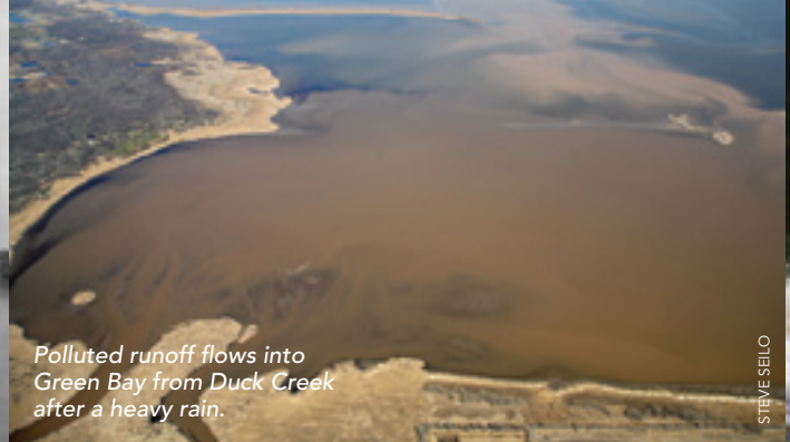
Polluted runoff flows into Green Bay from Duck Creek after a heavy rain.