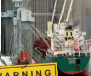
The Duluth-Superior harbor is the largest shipping port on the Great Lakes.