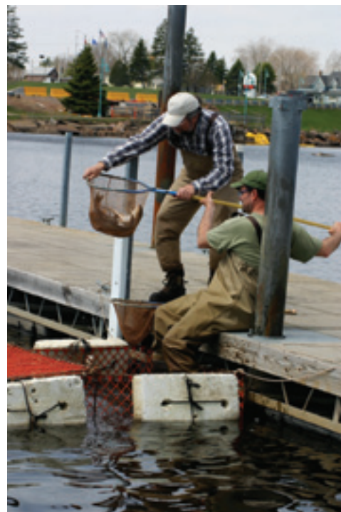
Researchers capture white suckers for tumor and deformity evaluation.