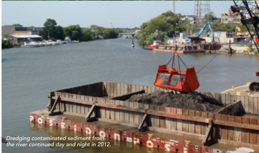
Dredging contaminated sediment from the river continued day and night in 2012.

"After a long time of negotiation, interim steps and study, companies that were responsible for the contamination took care of their responsibilities for sediment cleanup under the Superfund program in recent years," Pappas says. "That really set us on the path to being able to deal with the remaining legacy pollutants and begin restoring habitat."