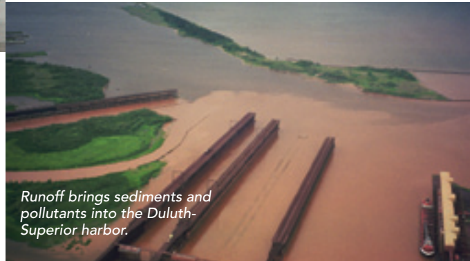
Runoff brings sediments and pollutants into the Duluth-Superior harbor.