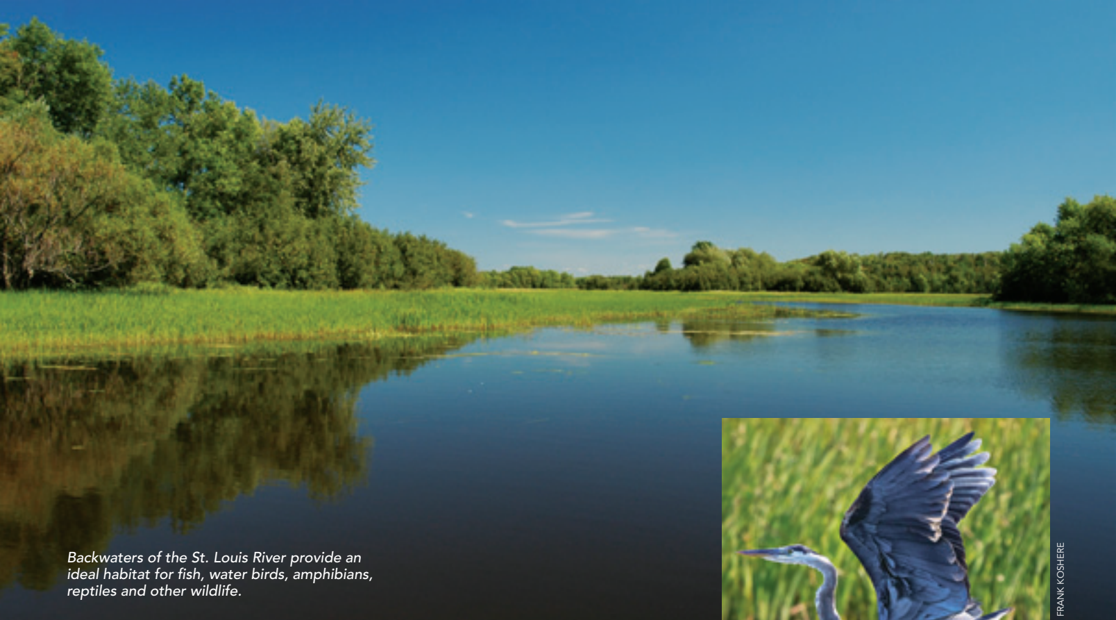
Backwaters of the St. Louis River provide an ideal habitat for fish, water birds, amphibians, reptiles and other wildlife.

to control pollution sources, restore habitat and remediate environmental problems.