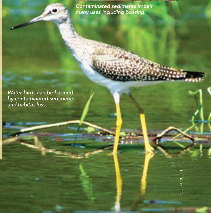
Water birds can be harmed by contaminated sediments and habitat loss.