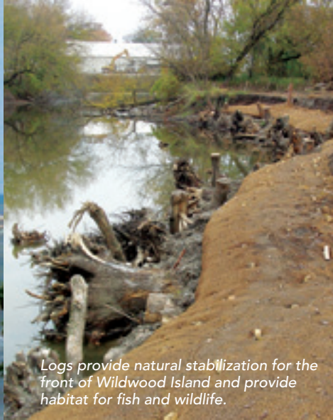
Logs provide natural stabilization for the front of Wildwood Island and provide habitat for fish and wildlife.