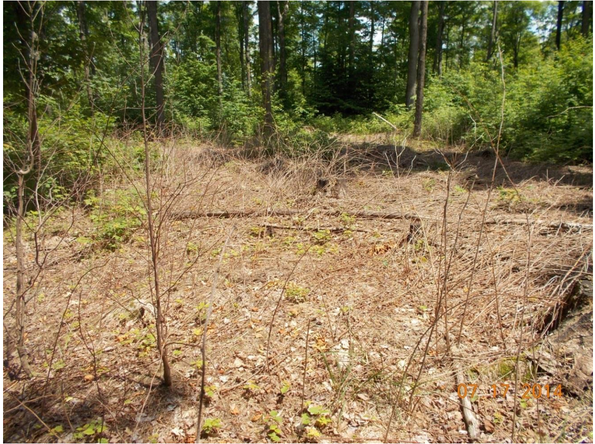
Sugar maple seedling establishment following a poor seed crop. There are still 6000 MH seedlings per acre in this photo. Spring ephemerals such as blood root, violet, blue cohosh, were able to reestablish following the herbicide treatment.