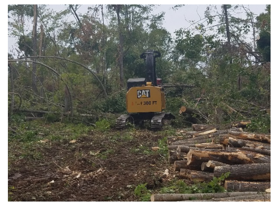
A contactor works to clear the south end of Diamond Roof Road using retained receipts from stewardship contracts on the National Forest.