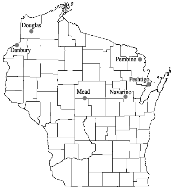
Figure 1: American Woodcock collection sites 1999–2001.

American Woodcock .—Detailed methods of woodcock sample collection and analysis can be found in Strom et al. (2005). Briefly, woodcock were harvested between 1999 and 2001 at selected locations in Wisconsin using steel shot (Figure 1). Birds were collected a minimum of two weeks prior to the regular hunting season (late September through early November) to increase the probability that only locally exposed birds (young of year) would be collected. Woodcock age and sex were determined via plumage characteristics as described by Sepik (1994). Pointing dogs were used to assist in finding woodcock nests and broods. When a brood was found, one chick was randomly selected and