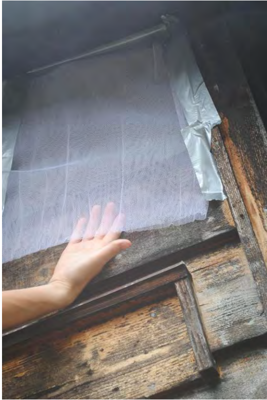
Space on bottom for bats to escape

Remember that bats will not chew their way back inside your house. So, after you've found and sealed all of the access points you will have successfully excluded the bats from your living space.