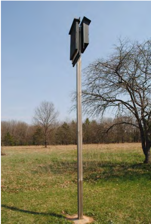
Two types of bat houses

success. As bats come and go, they will become familiar with the structure. Upon exclusion, this familiarity will provide the best possible chance for the successful inhabitation of the bat house by the recently excluded bats. If you are interested in purchasing or building bat houses, contact the Wisconsin Bat Monitoring program. The program staff can help you decide on where to purchase the best bat house design with proven success. The Wisconsin Bat Monitoring program can also give you instructions for building your own bat house. Read our information pamphlet titled: "Building a Bat House" to learn how to build and locate your bat house. Location and design are critical pieces as bats are more difficult to attract to a bat house than birds are to a bird house.