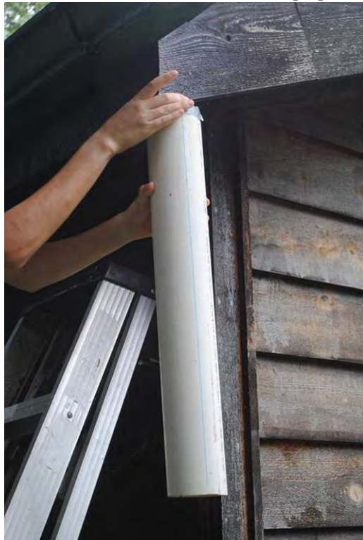
PVC one-way door

Other materials can be used to create one-way exits, such as plastic sheeting or PVC pipe. Install the plastic sheeting in the exact manner as the plastic netting. A portion of PVC pipe, which should be similar in size to a tube of caulk, can be inserted into the opening. Seal the