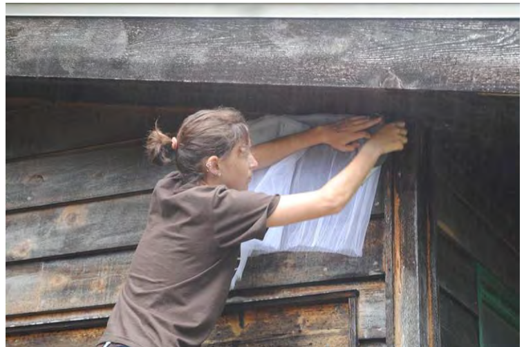
Applying screen for one-way door

One-way exclusion devices can be created using plastic netting with one-sixth inch (0.4 centimeter) or smaller mesh. Shape the plastic netting so that it covers the opening entirely and extends at least two feet below it. Using staples or duct tape, attach the top and side edges of the