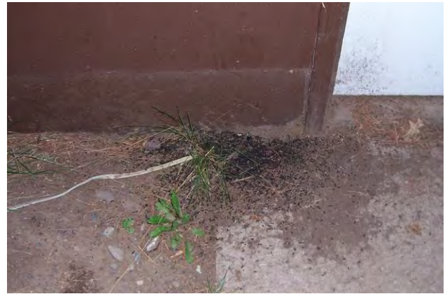
Bat guano in front of garage

Visible signs such as staining and guano (bat droppings) will also help identify openings. The body oils of bats can cause