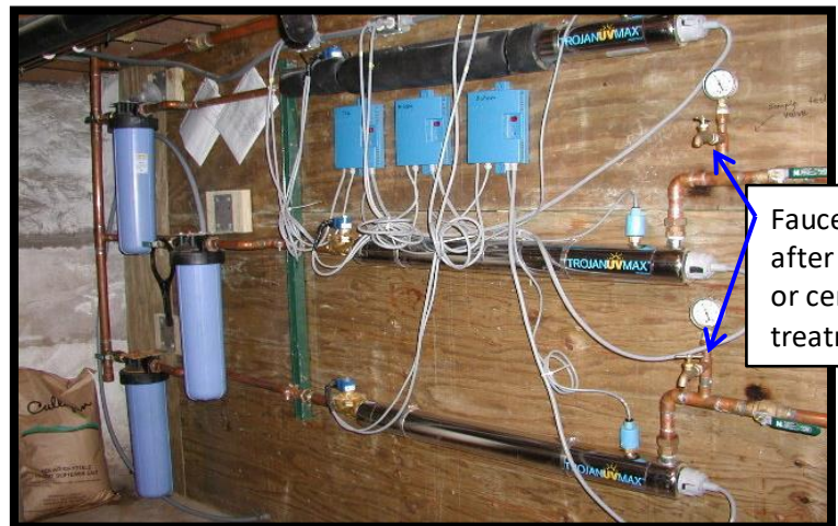
Faucets after POE or central treatment