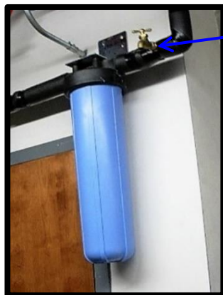
Faucet after POE or central treatment