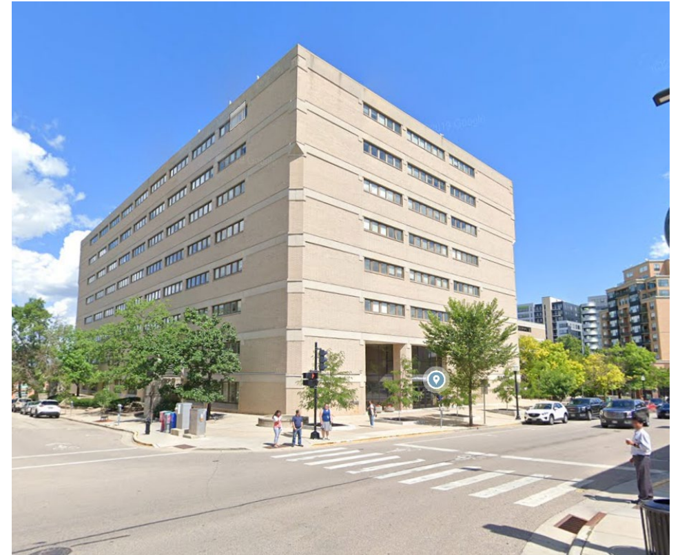
Wisconsin DNR Central Office (GEF2) 101 S. Webster St. Madison, WI 53707