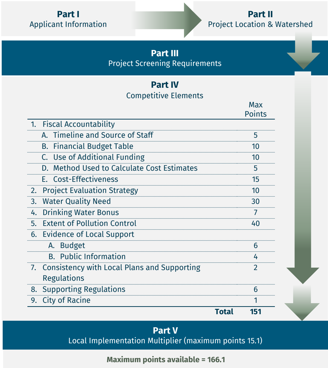
Figure 1 UNPS&SW-Construction Screening & Scoring Process