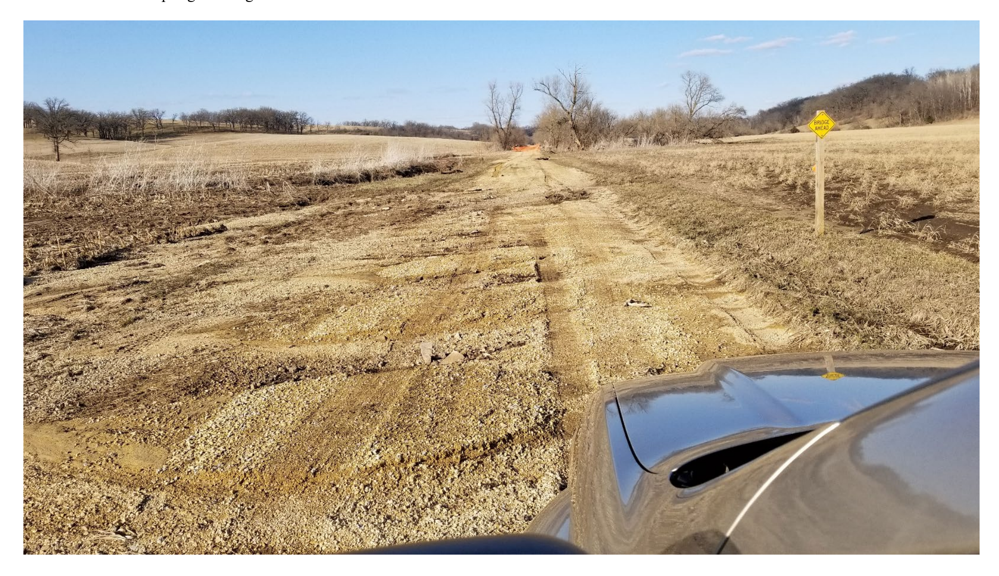
Trail condition after spring flooding. Just to the east of Browntown in Green Co