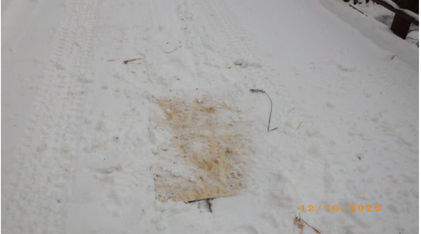
OSB Deck patching on top