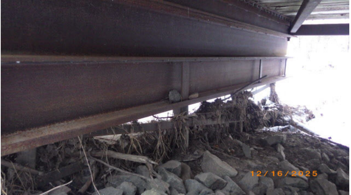
Center pier good condition with some minor debris on pier