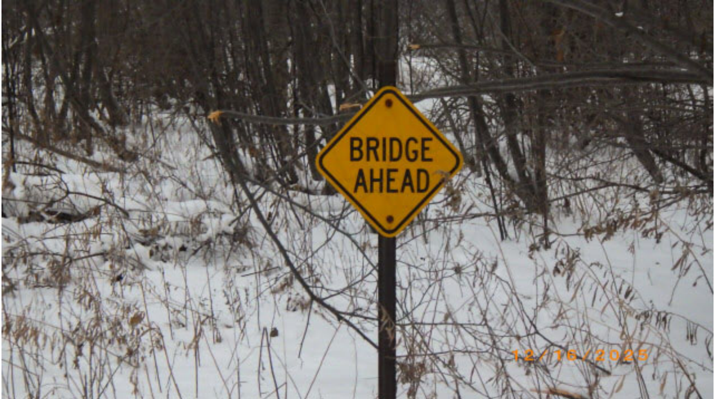
South bridge ahead sign, CS3 map cracked