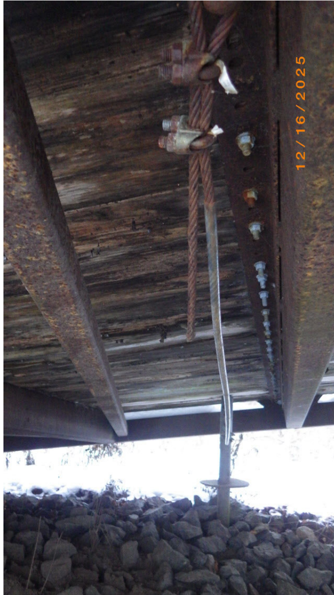
Helical anchor / cable to keep bridge in place during flooding