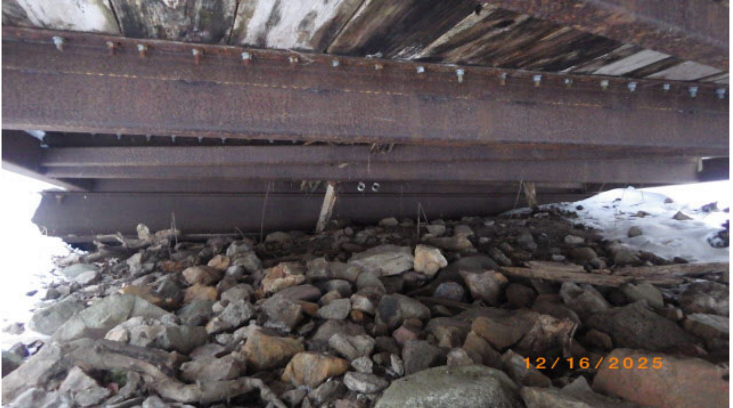
North abutment, good riprap