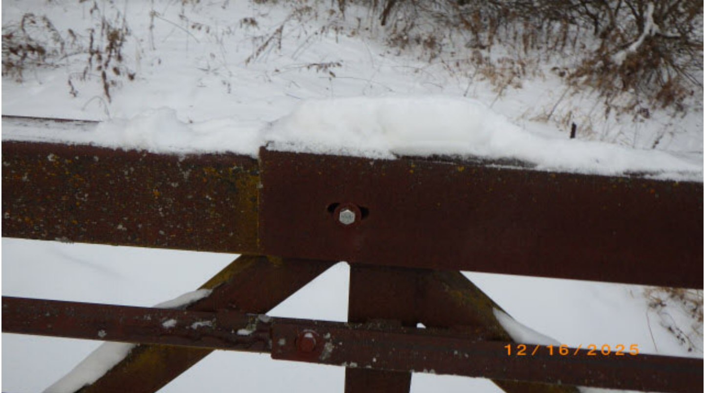
Rail splice at pier, no visible expansion or contraction