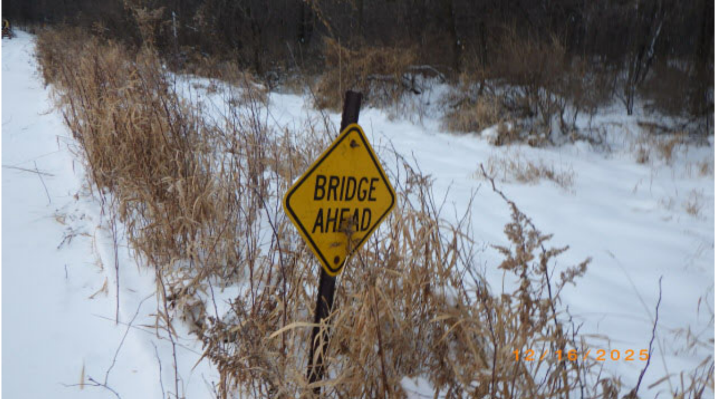
North bridge ahead sign, CS3 map cracked