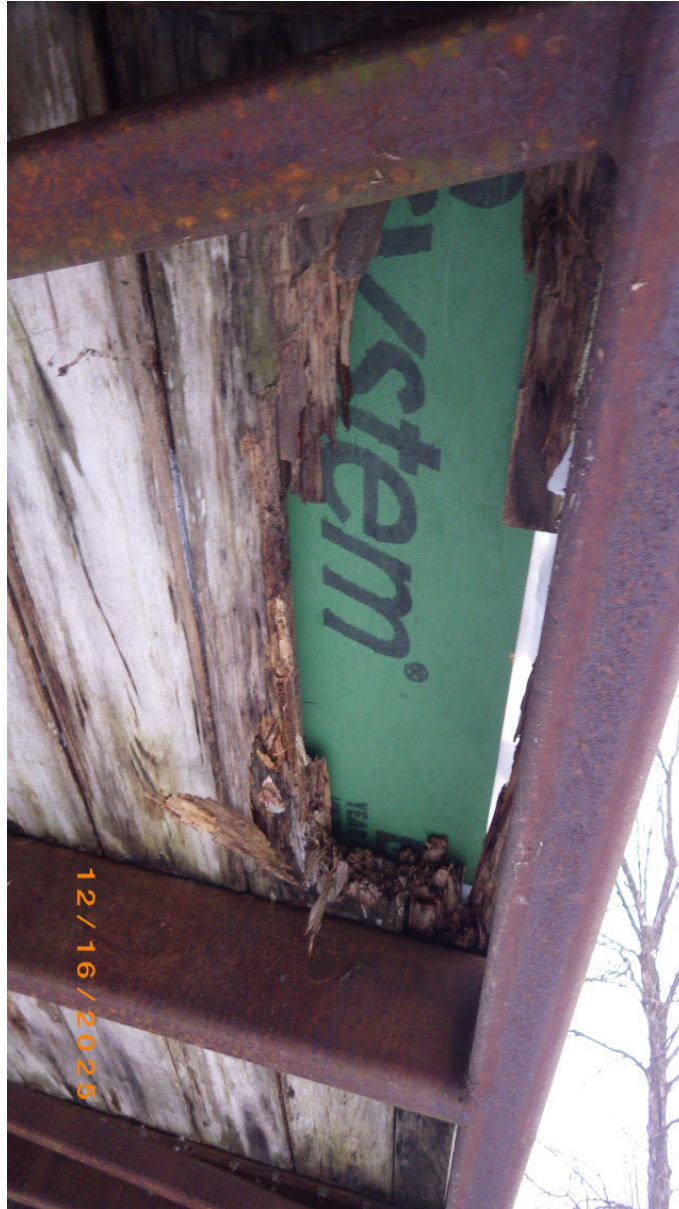
Typical widespread deck failures