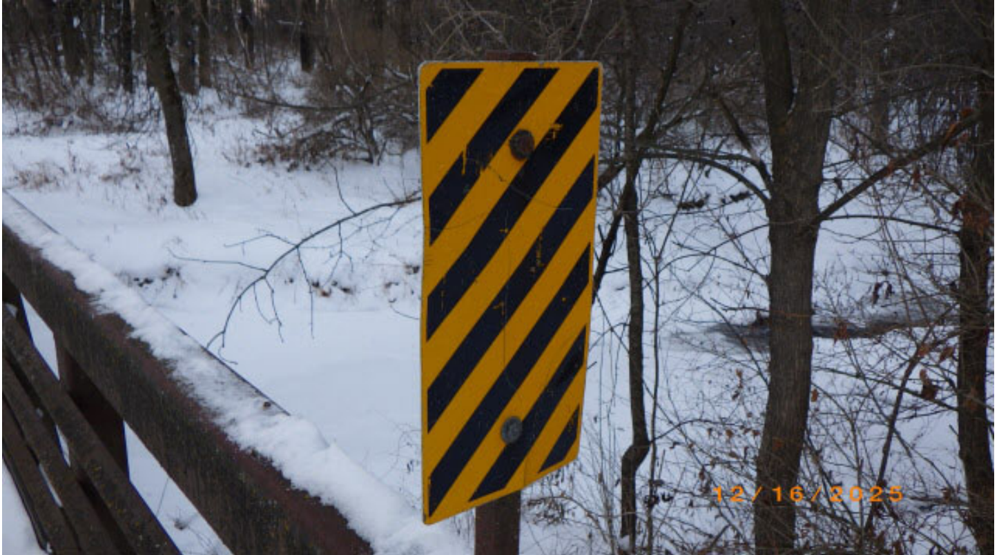
Typical object marker CS3 cracking