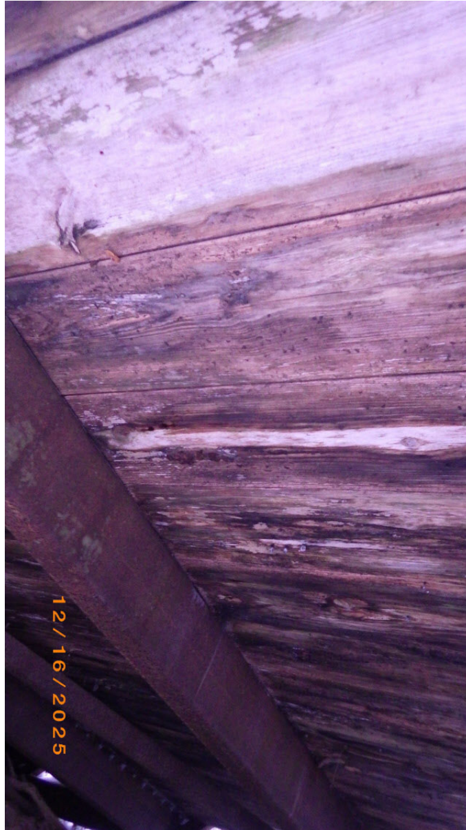
Typical widespread CS4 decay in decking