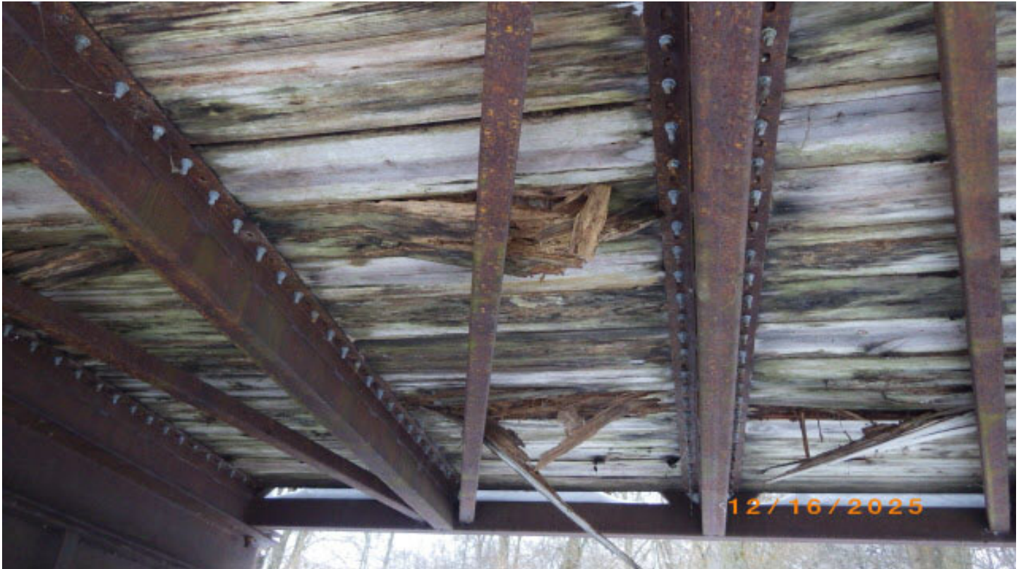
Typical widespread deck failures