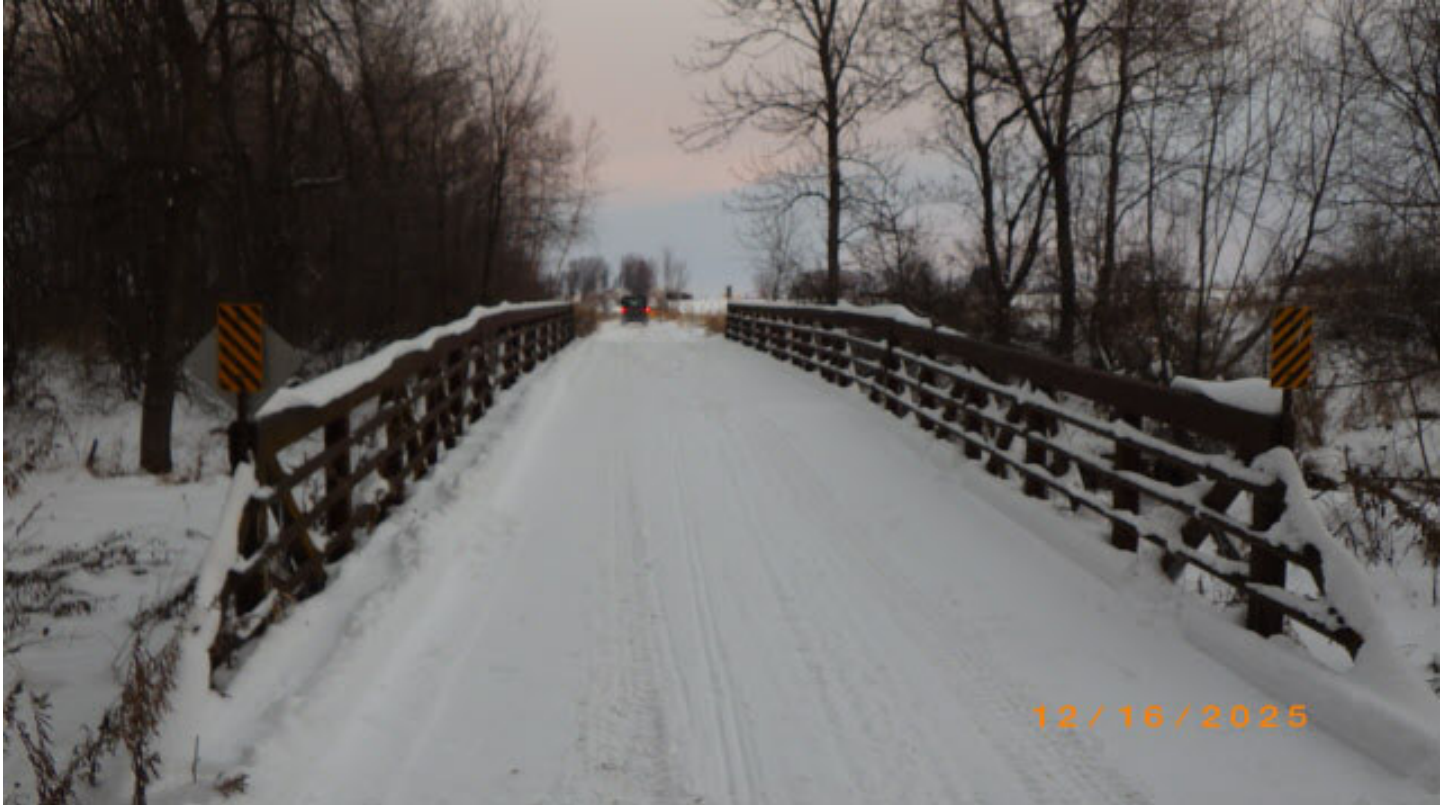
Top of deck from south