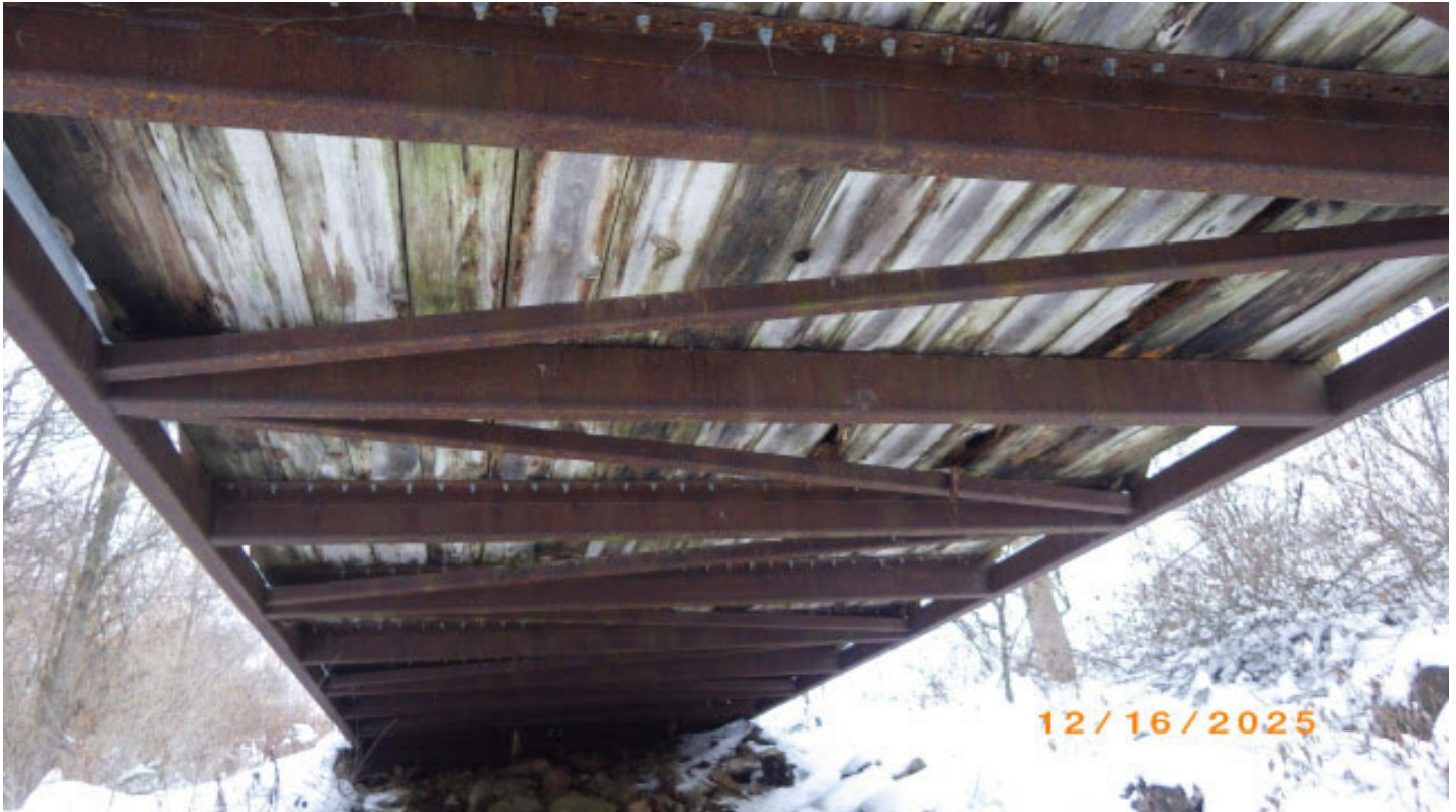
Typical deck / floorbeam underside.