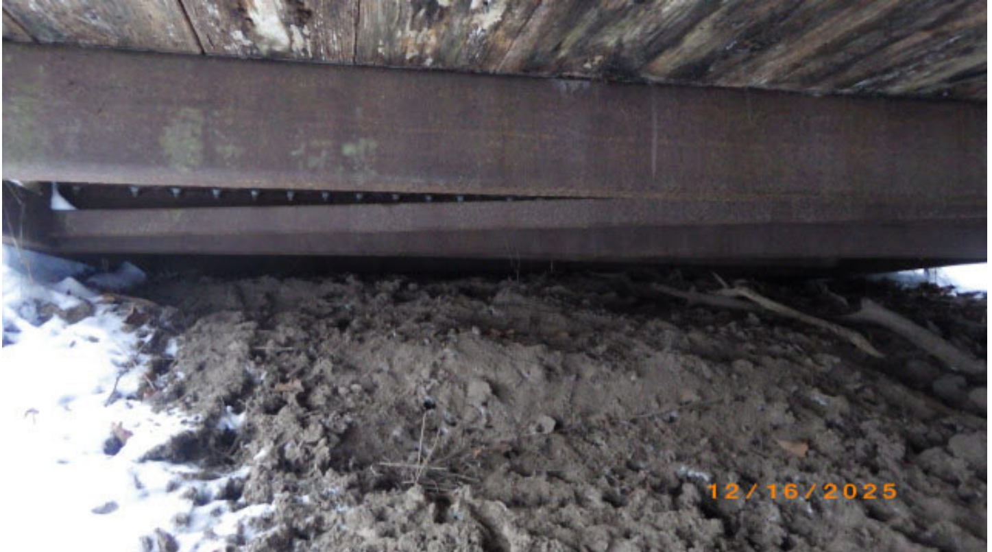
South sill, no riprap