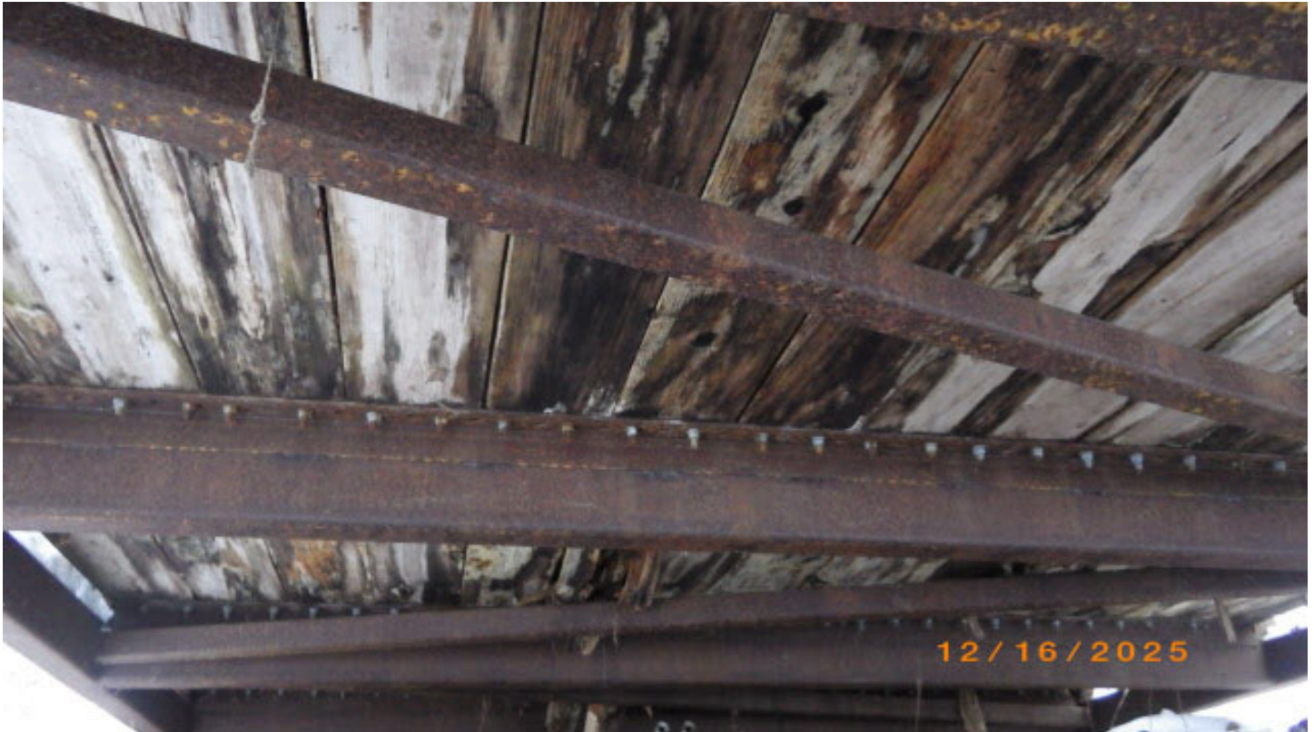
Typical widespread CS4 decay in decking