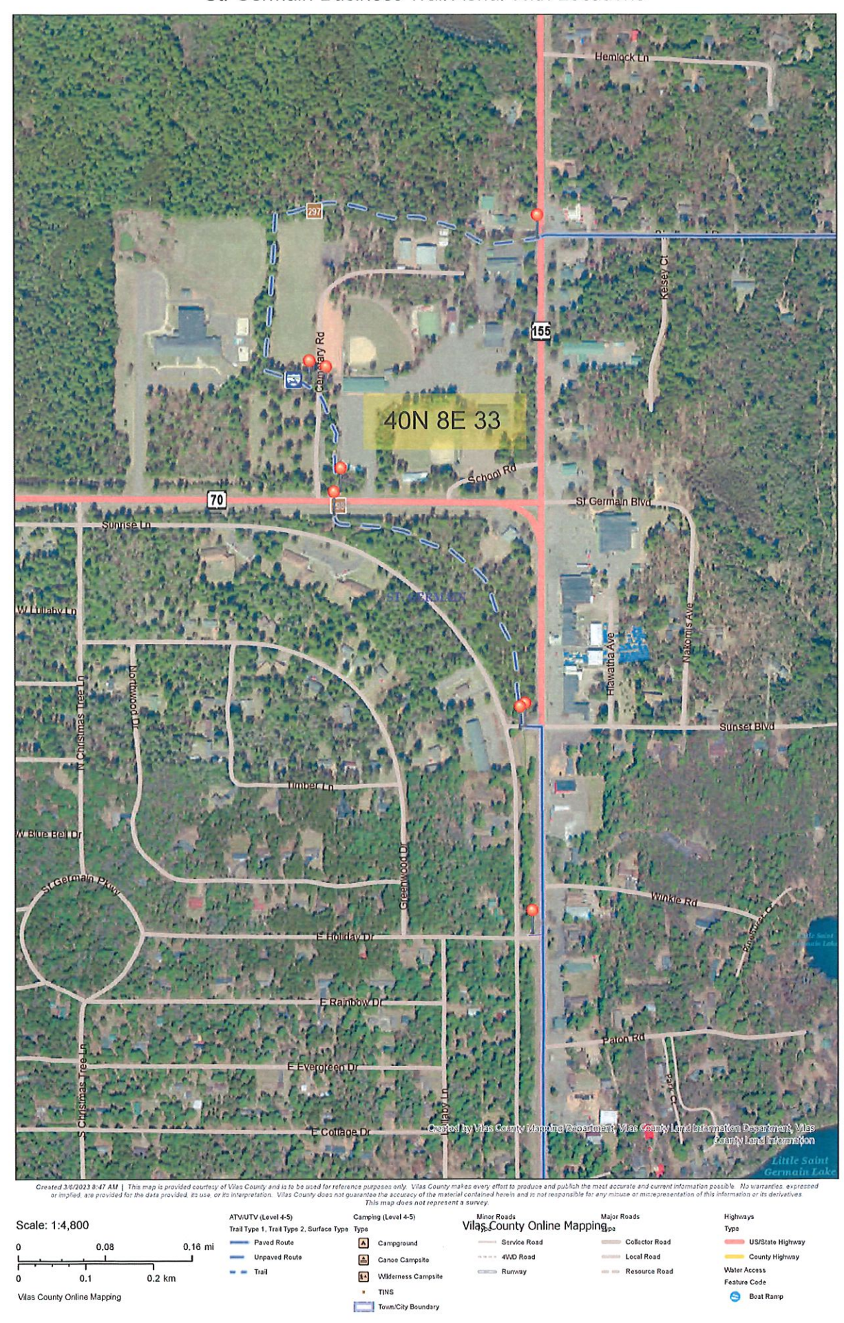
St. Germain Business Trail Aerial With Locations