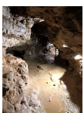
We will explore caves at Ledgeview Nature Center.

Stay tuned for additional information, details and an itinerary.