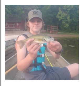
Brody, Racine Co.

"Get out fishing this summer and while you are at it - enter your fish in the YCC contest!"