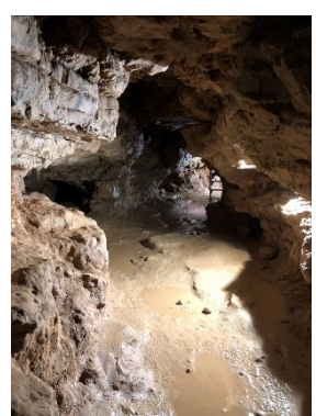
We will explore caves at Ledgeview Nature

Program fees have been graciously donated by local conservation organizations.