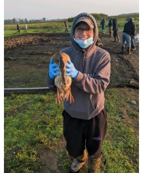
Plan for early morning duck banding