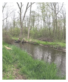
Trout Unlimited has invited the YCC to help with in-stream habitat work on the Onion River