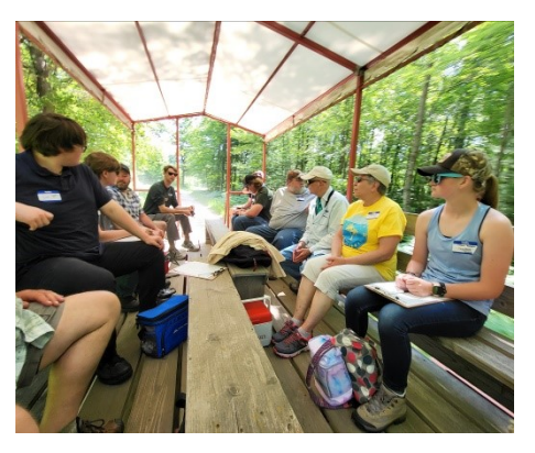
Touring Sandhill by wagon was a great way to discuss careers and all of the support needed to run a state DNR property.