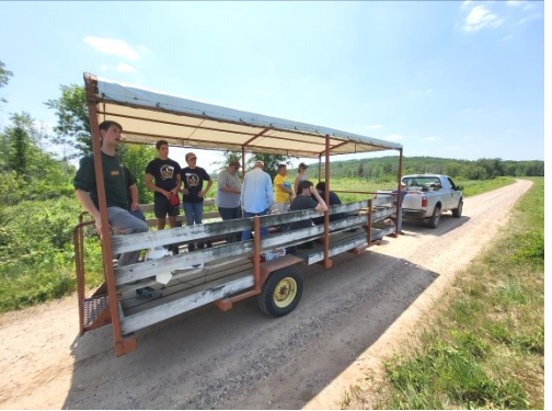
A covered wagon was pulled by a Friends of Sandhill volunteer. We learned about all aspects of Sandhill on this tour.