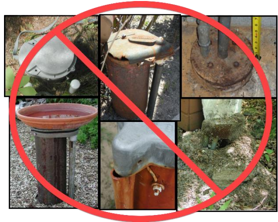
Well Head Issues

In most situations, the Level 2 Assessment will be able to identify corrective actions to help eliminate the coliform bacteria contamination in the water system. In addition to completing site specific corrective actions most water systems will also be required to chlorinate the well and water piping to disinfect the system.